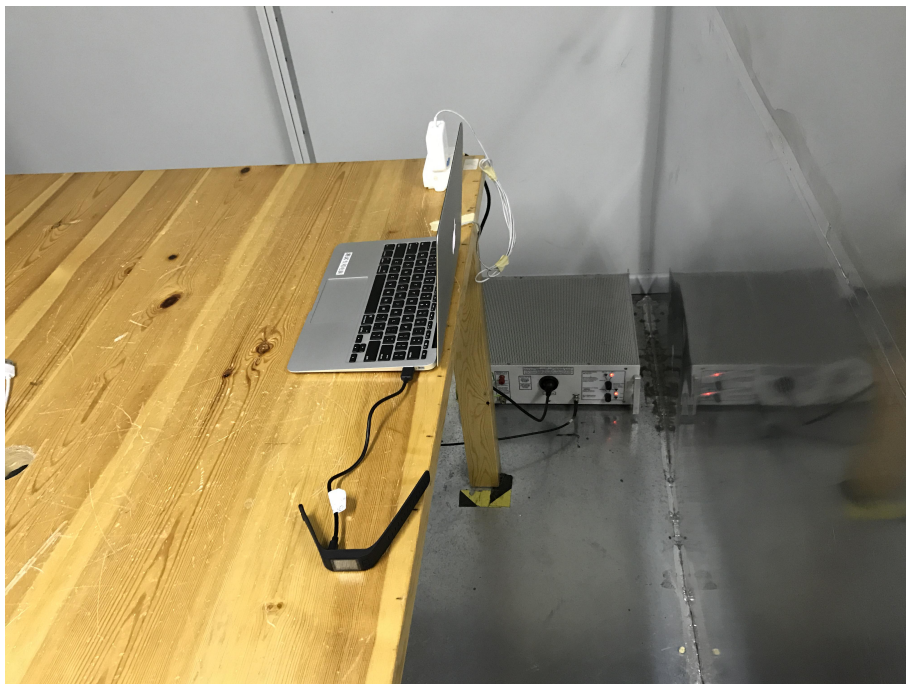
Conducted Emission Test