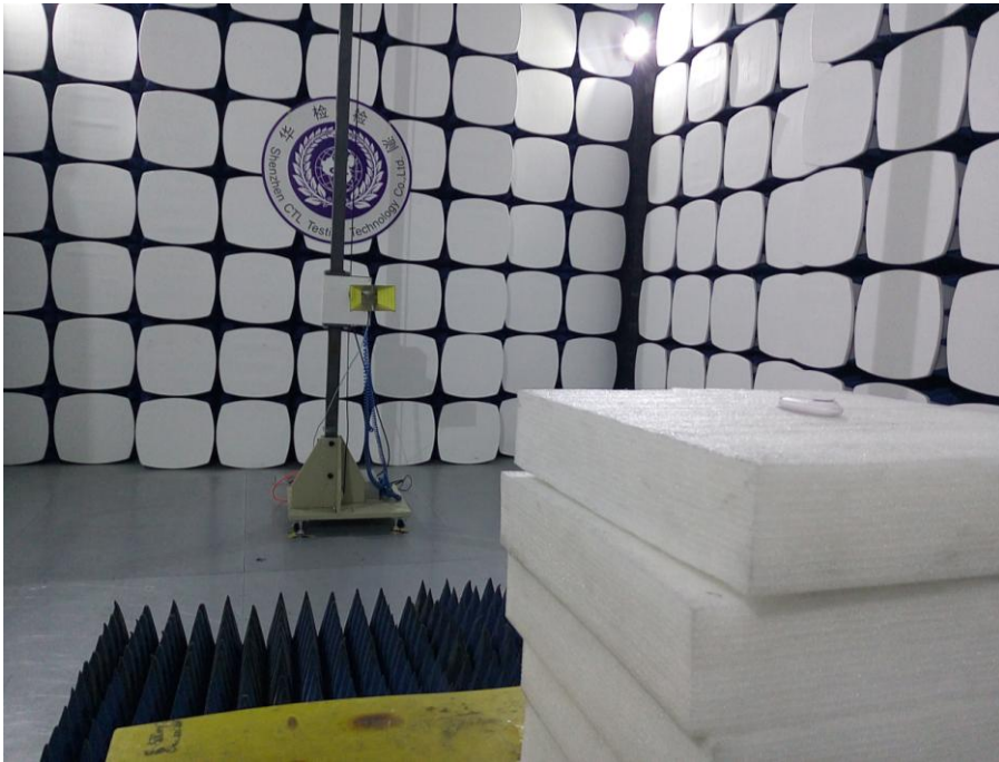
Above 1GHz: Test height 1.5m, the styrofoam block placed in the 0.8 m high test table.