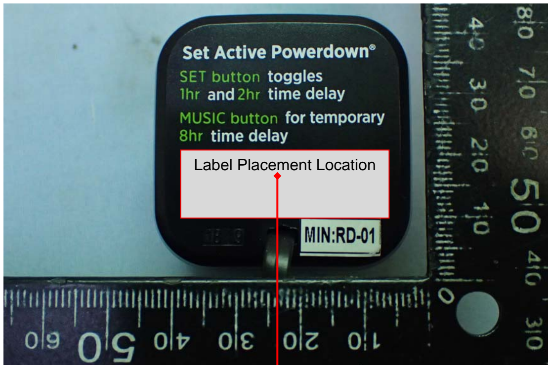
FCC ID, IC Label Placement Location