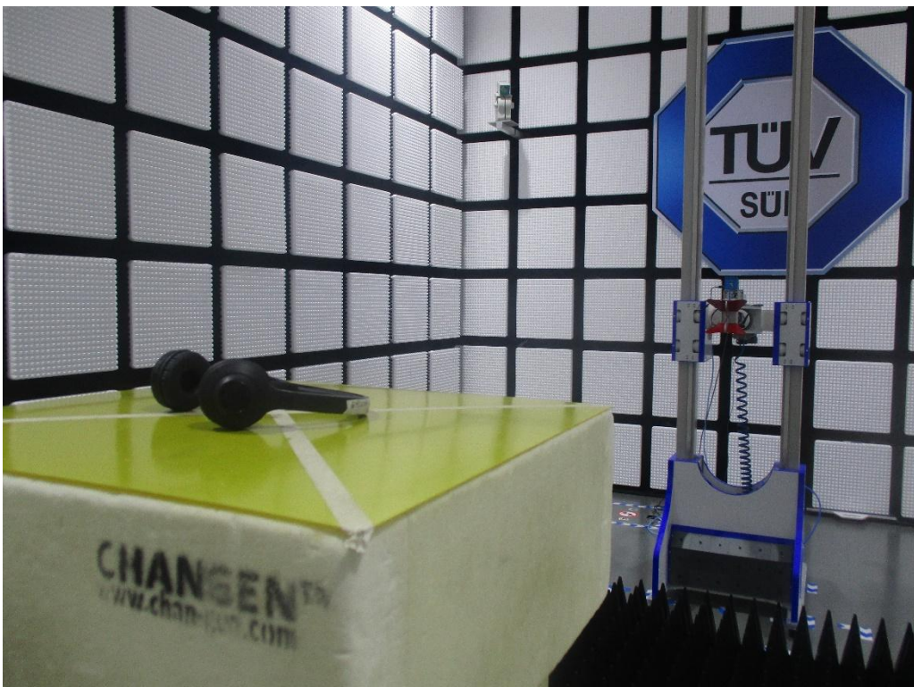
Radiated Emission Test above 1 GHz