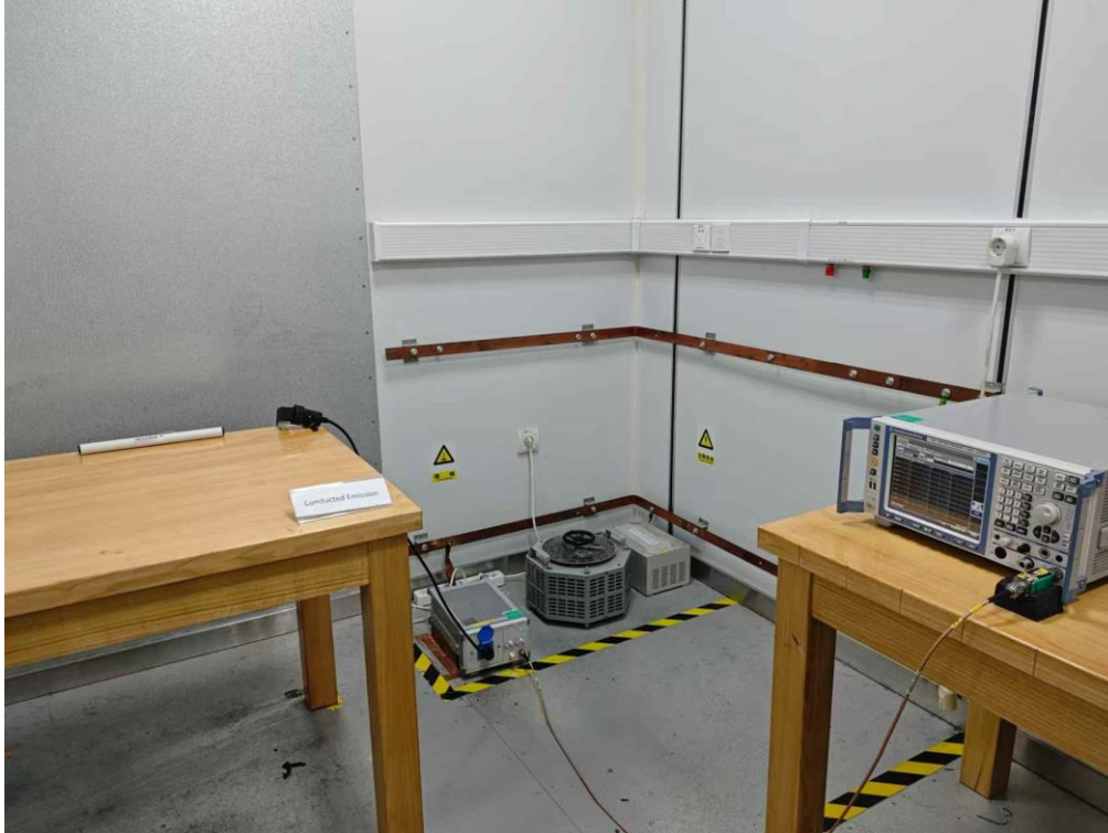
Conducted Emission Setup