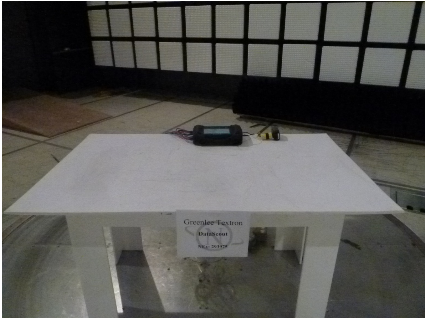
Figure 3.6-2: Setup Photo – Radiated Emissions < 1GHz