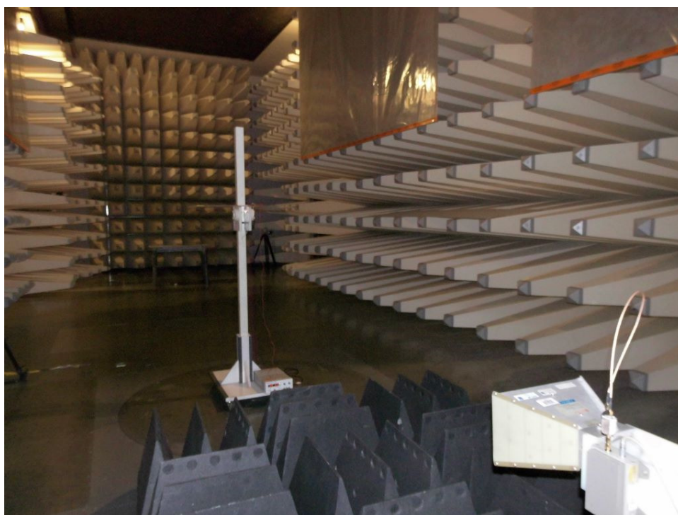
Set-up for Radiated Emission