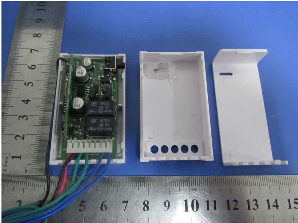
Uncover- Front View