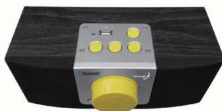
Sovereign USB Memory Stick Player