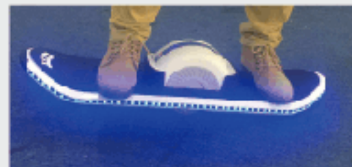
After the official start, the car will focus on the experience of a move