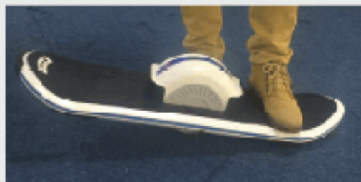
The first step on the car left foot on the first step