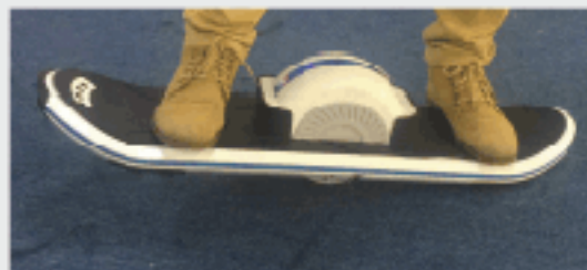
Step on the right foot, the car from the balance of the lift