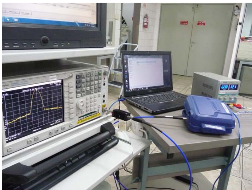
Photograph No.1 Setup for peak output power measurements