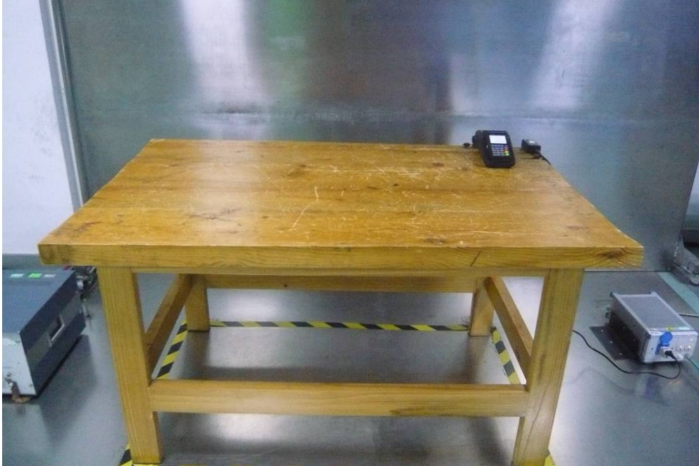
Conducted Emission-Side View(Adapter#1)