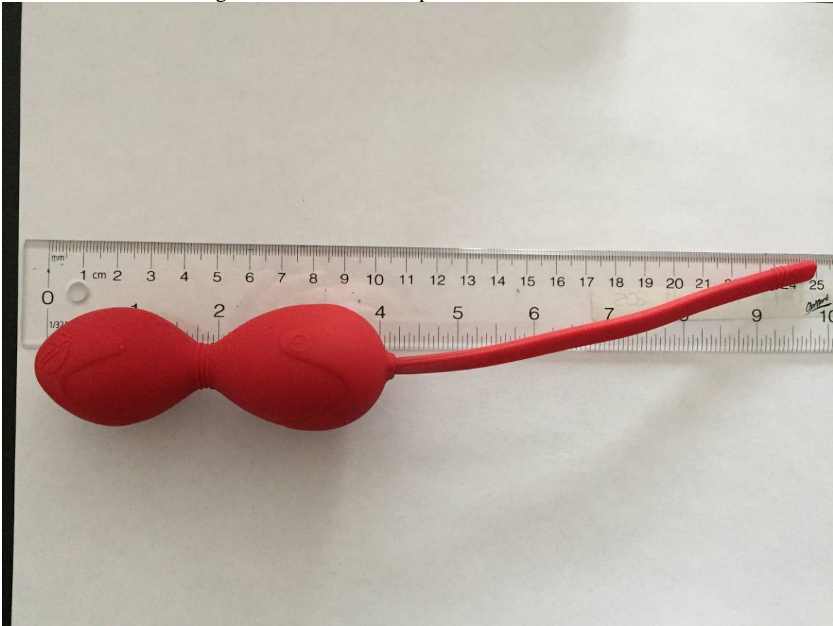
Figure 1 – EUT Close Up – ON/OFF button side