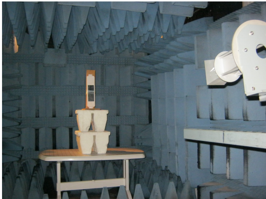
Radiated Emission Test, 18-26.5GHz