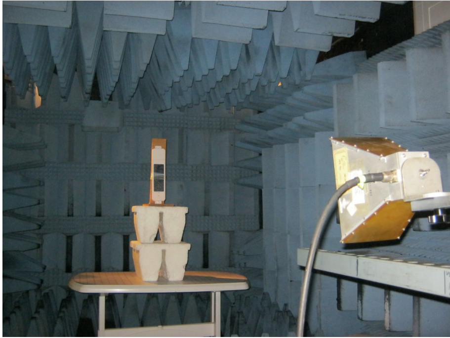
Radiated Emission Test, 1-18GHz and Intermodulation Radiated Emission Test