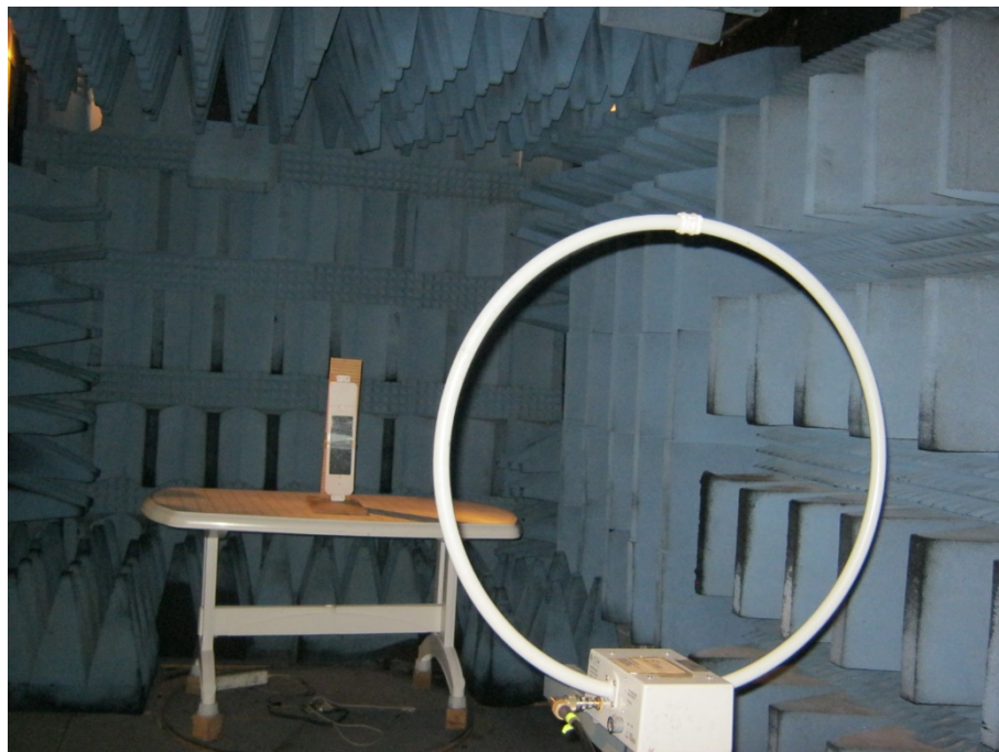
Radiated Emission Test, 0.009-30MHz