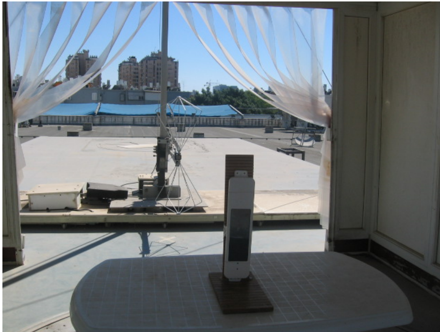
Radiated Emission Test, 30-200MHz