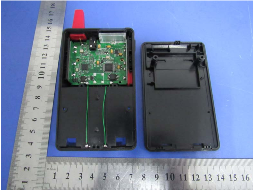
Uncover- Front View