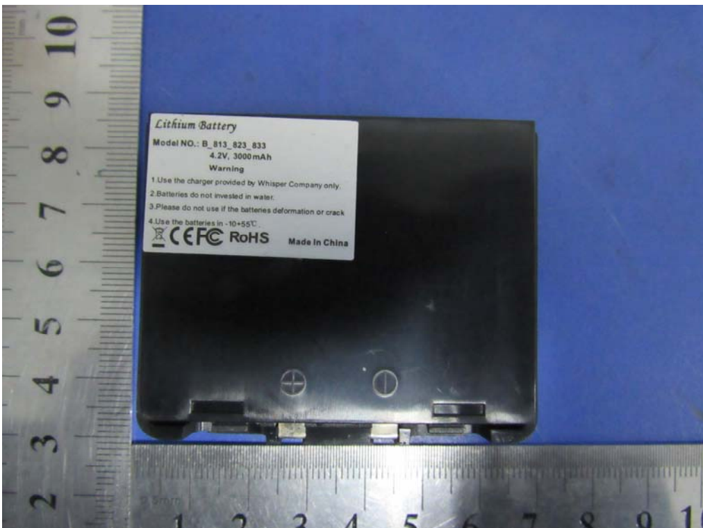
EUT Battery – Front View