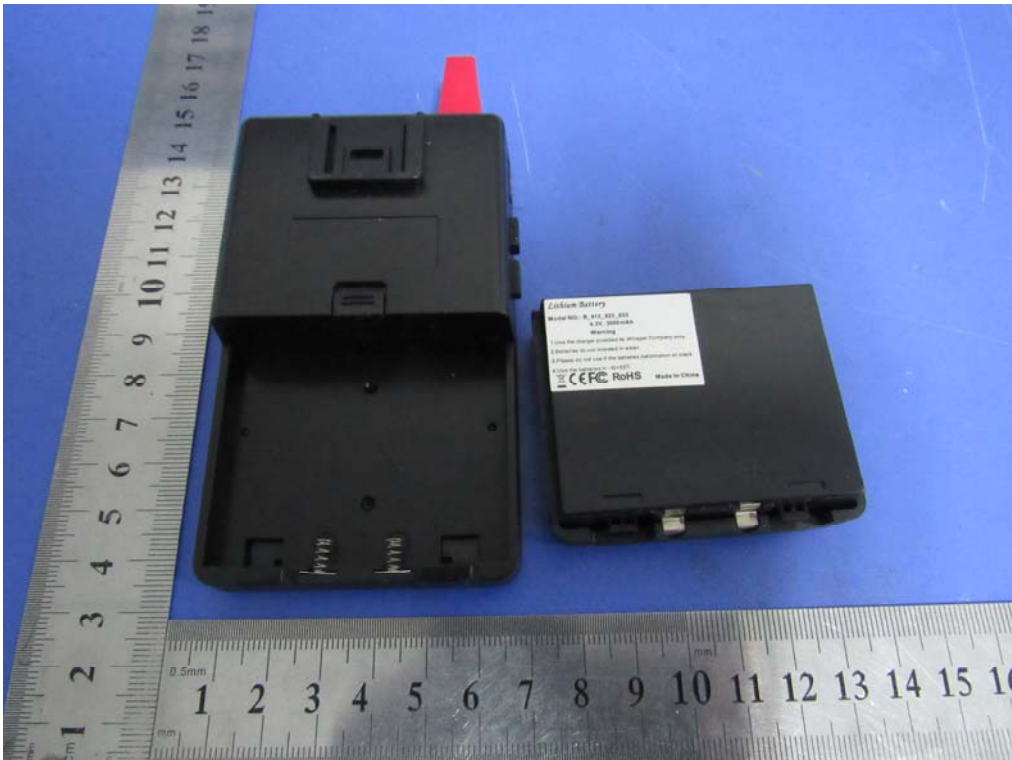
Whole Package – Top View