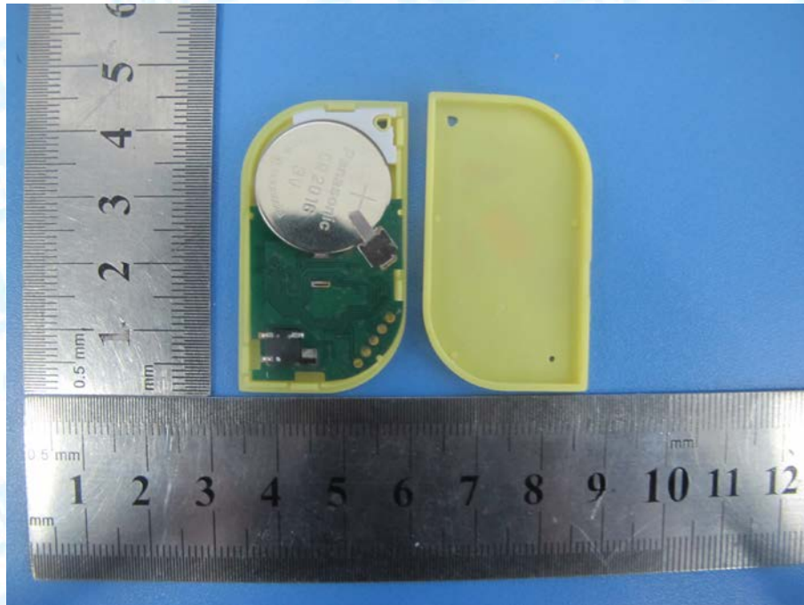
Photo 5 Appearance of PCB