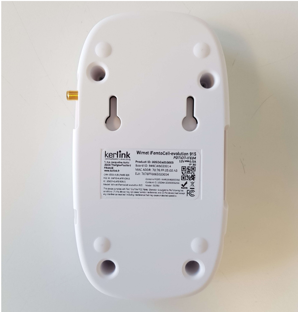
General view of the Wirnet iFemtoCell-evolution 915