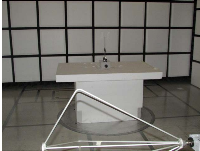
Figure 3: Radiated Emissions - Front View – Below 1GHz