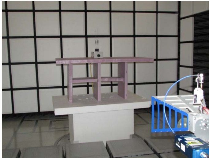
Figure 1: Radiated Emissions - Front View – Above 1GHz