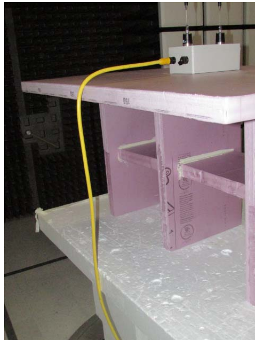
Figure 2: Radiated Emissions - Rear View – Above 1GHz