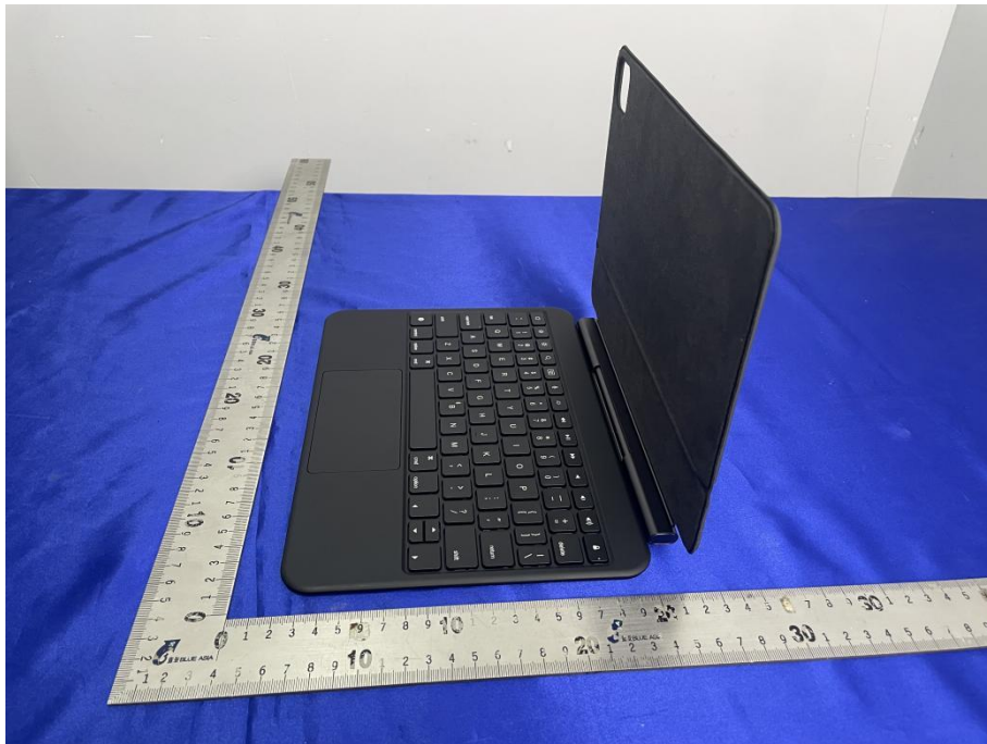
View of Product-7