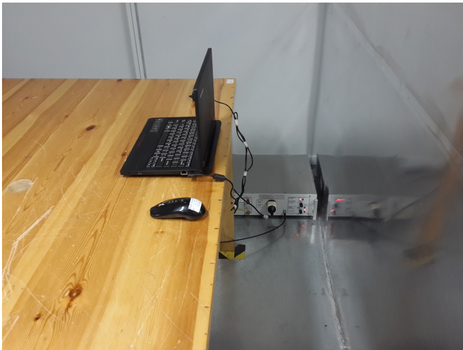
The Working test mode