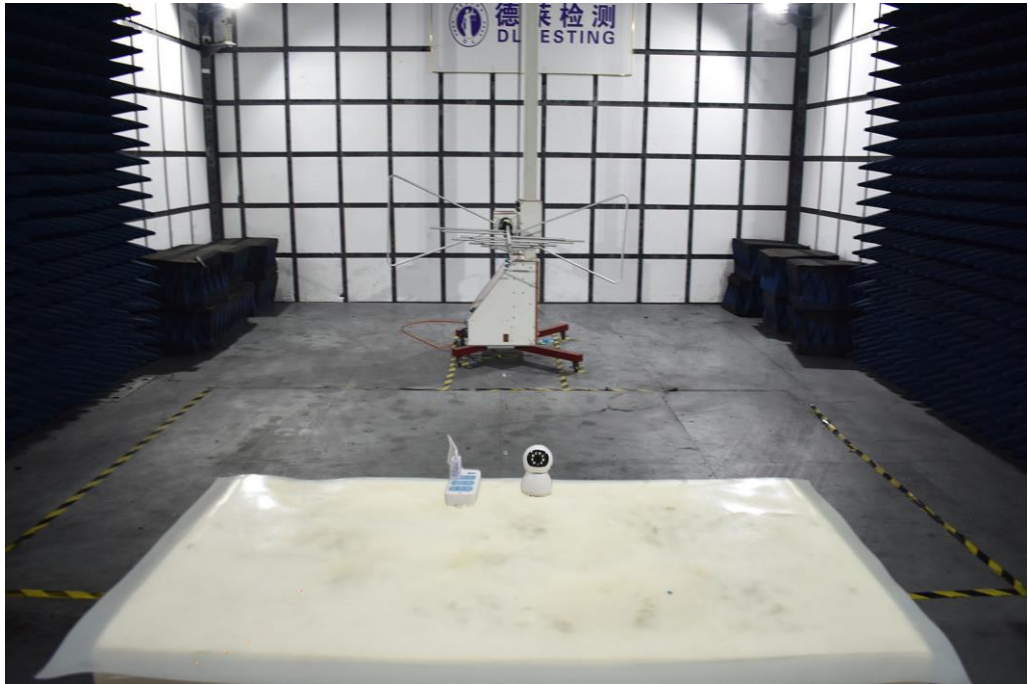
Radiated Measurement Photos