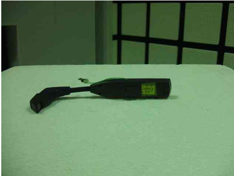
– X axis –