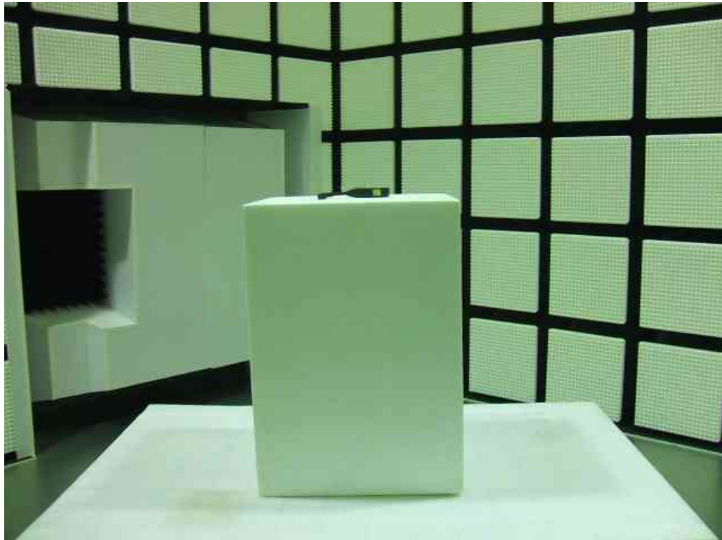
– Front View–