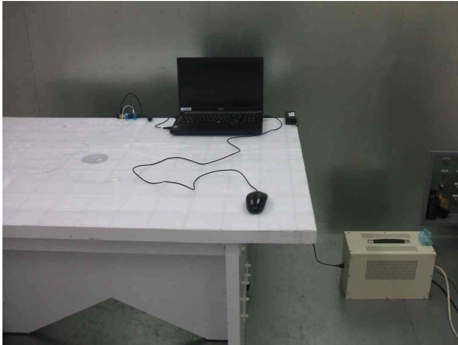
– Front View –