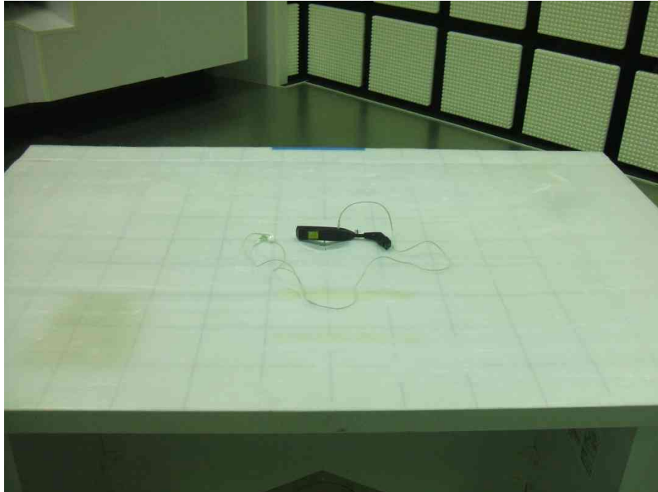
– Front View –