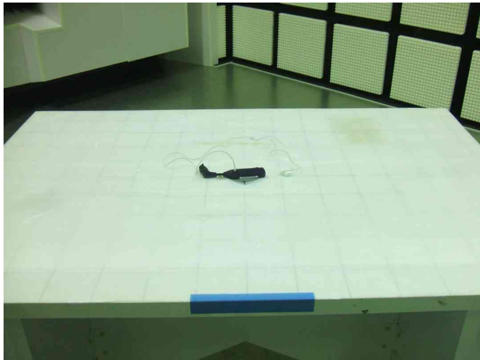
– Rear View –

Photograph present configuration with maximum emission