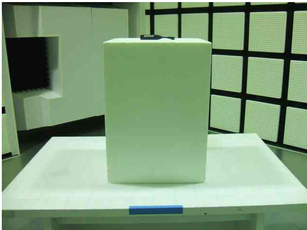
– Rear View –

Photograph present configuration with maximum emission