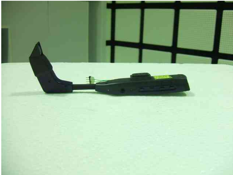
– Y axis –