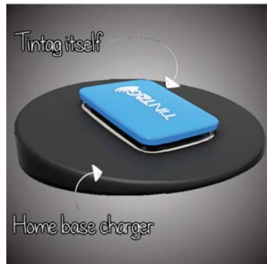
Figure 5: Proceeding to Adding Tintags to Your Mobile App

Swipe Down to add a new Tintag for connecting to the phone app.