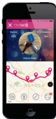
Figure 12: Map of Last Tintag Locations

The application keeps track of the locations where your item to which it is attached was last seen so that you can easily remember where you've left it. You can also cycle through all the locations where the Tintag was detected.