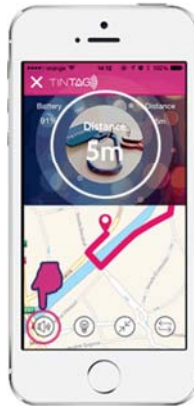
Figure 9: Find Your Tintag via Buzzer

When the Tintag is in range and connected, you can start a buzzer alert from the mobile app. If the phone is out of Tintag's range, then the buzzer button is not visible, meaning that the devices are disconnected.