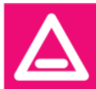
Figure 4: Launching TinTag Application

Tap the TinTag icon on your phone to launch application.