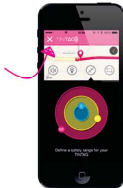
Figure 14: Disconnect from Tintag

You can leave the detail area of a Tintag you are connected to by tapping the x on the upper left corner of the window. This way you can easily go through all the Tintags associated to your phone.