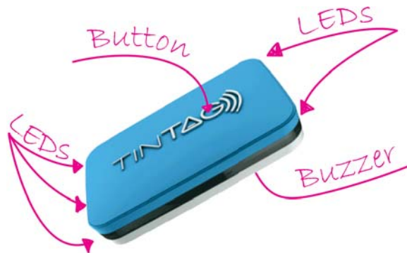
Figure 2: TinTag LEDs and Button

The TinTag functionalities are achieved through the use of four LEDs, a buzzer, and one button.