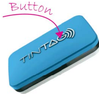
Figure 13: Button on Tintag

If you have lost your phone, and it is in range of an associated Tintag you can start an acoustic notification on your phone by pressing the button on the device. You can walk around the locations where your phone running the application might be. If you are getting close to it, as you press the button, it will signal its presence through the sound alarm.