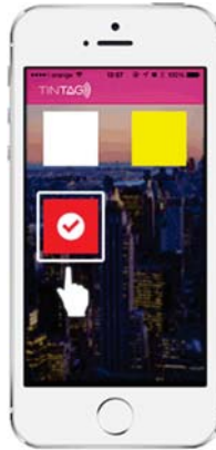
Figure 7: Selecting one Tintag in the Mobile App (Picture showing app and corresponding Tintag)

Wait until all the Tintags in the vicinity are detected and select one of them. You will note that the colour of the icons is different for the devices, being the same as the casing of each one of them. When selected in the phone app, the corresponding Tintag will start the buzzer and will flash the LEDs for a short period of time, so that you know which one is it.