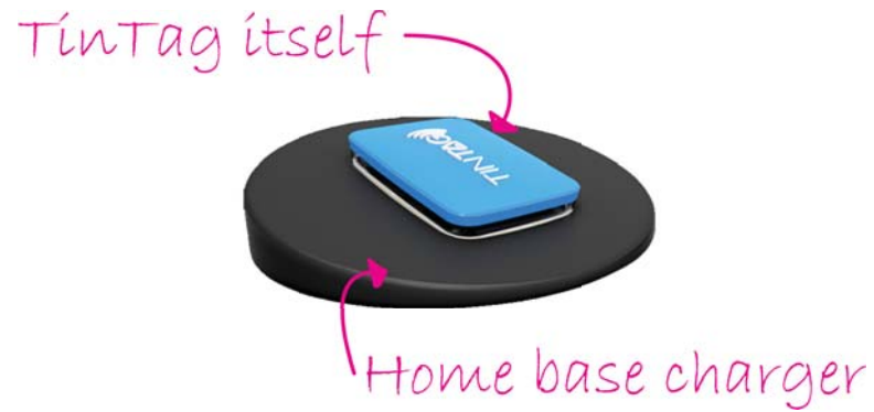
Figure 1: The TinTag Device and the Recharging Module

The TinTag functionalities are achieved through the use of four LEDs, a buzzer, and one button.