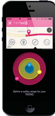
Figure 11: Monitor Distance from Tintag

This feature in the app enables you to monitor a Tintagged item within a preferred distance and to be notified when it gets further than the limits you set.