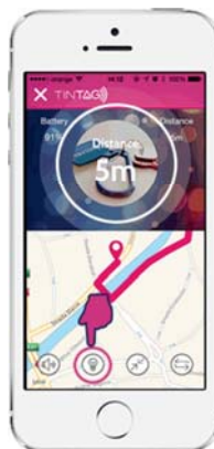
Figure 10: Find Your Tintag via LEDs

When the Tintag is in range and connected, you can flash the LEDs from the mobile app so that you can find it. If the phone is out of Tintag's range, then the LED button is not visible, meaning that the devices are disconnected.