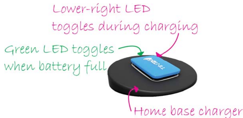
Figure 15: The Tintag Placed on the Recharging Module

The Tintag can be placed in any position on the home base charger, with the logo facing upwards. When placed on the charger and when initiating the charging procedure, all the four LEDs in the corners will flash for a short period of time. Then, the LED in the lower-right will toggle slowly during the charging period. During all this time you can monitor the battery level from your mobile app. When the battery is full, a green LED will also toggle, to inform you that you can replace the Tintag from the home base charger. The home base charger can be connected to any USB port of a device.