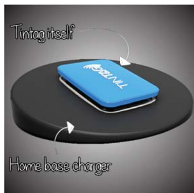
Figure 3: Downloading the Mobile App

Download the appropriate application depending on your phone, Android-based or iPhone, from App Store or Google Play.