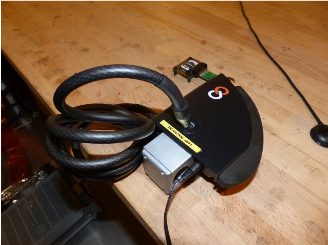
Photo 5: Test setup AE02 for conducted measurements, unintentional radiator §15) single device setup, computer peripheral.