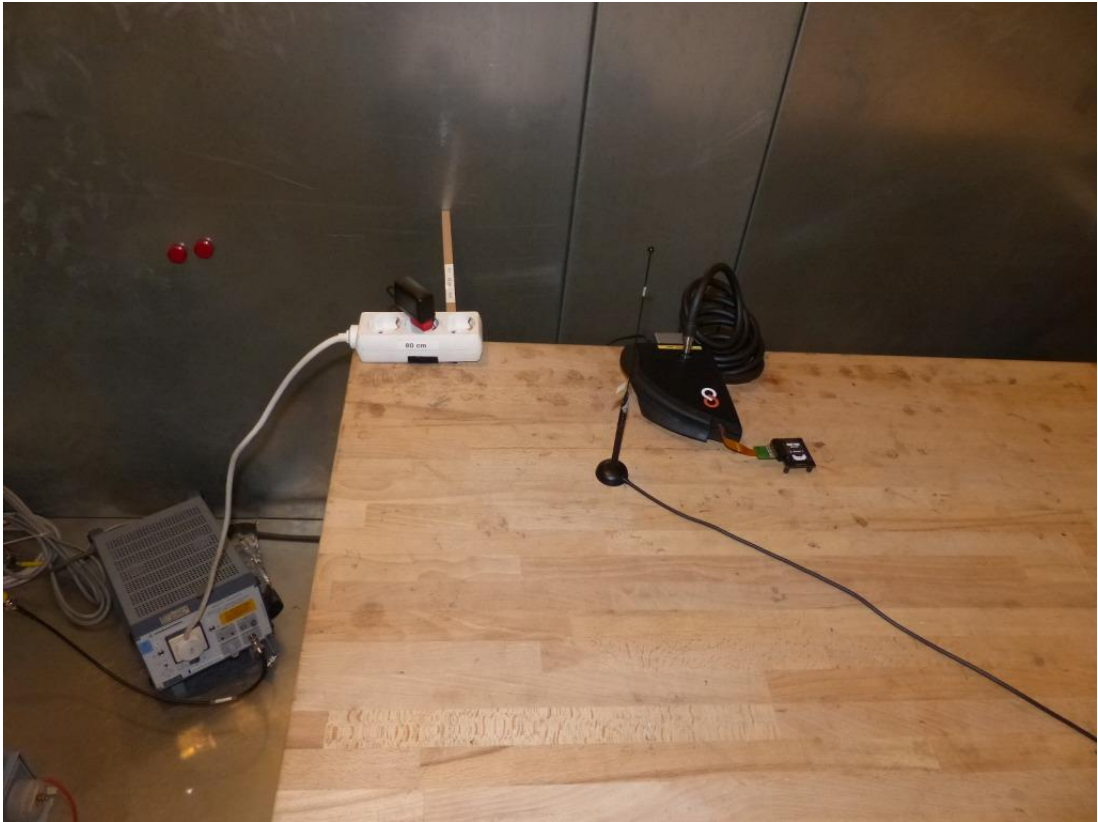
Photo 4: Test setup AE02 for conducted measurements, unintentional radiator §15) single device setup, computer peripheral.