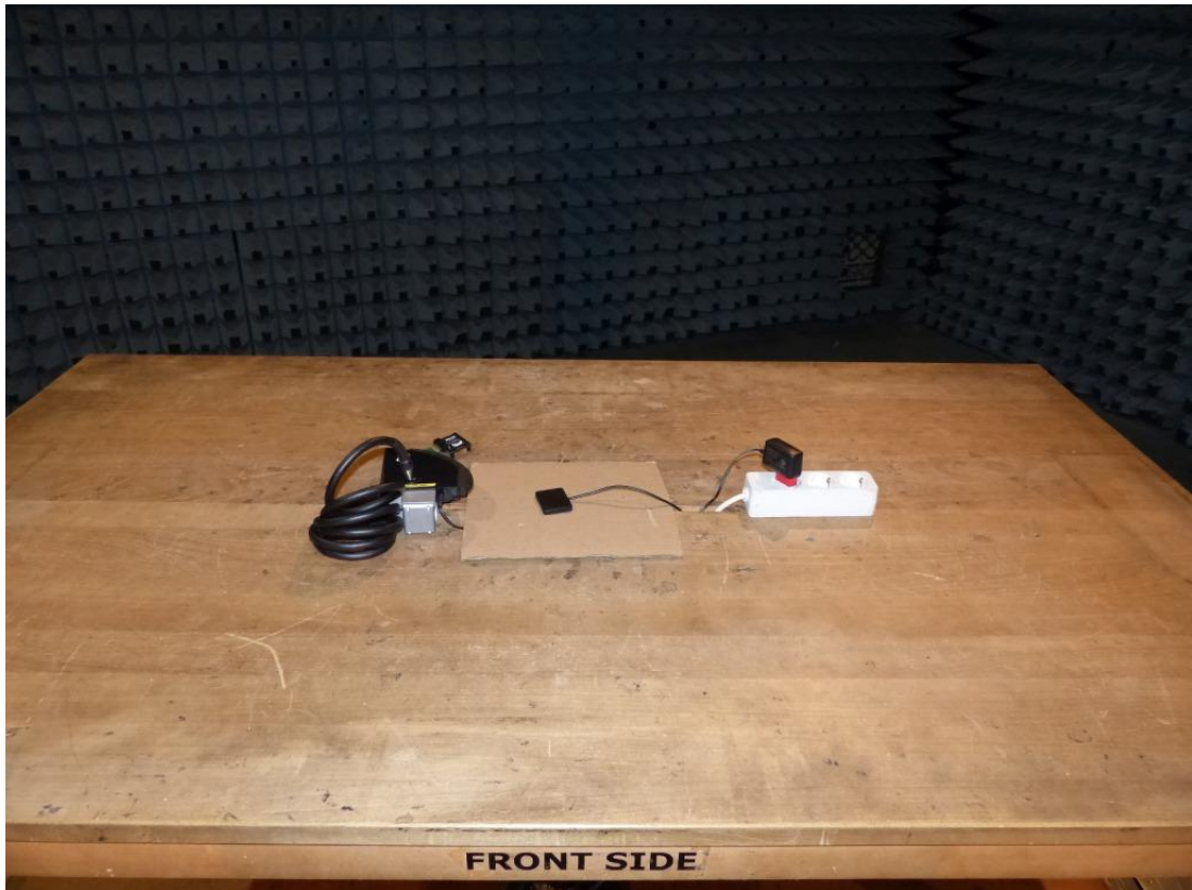
Photo 1: Test setup AB01 for radiated measurements, unintentional radiator §15) Single device setup.