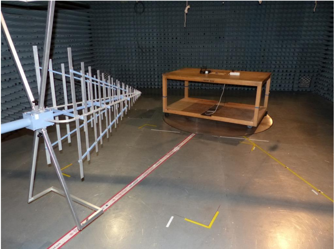
Photo 3: Test setup AB01 for radiated measurements, unintentional radiator §15) single device setup.