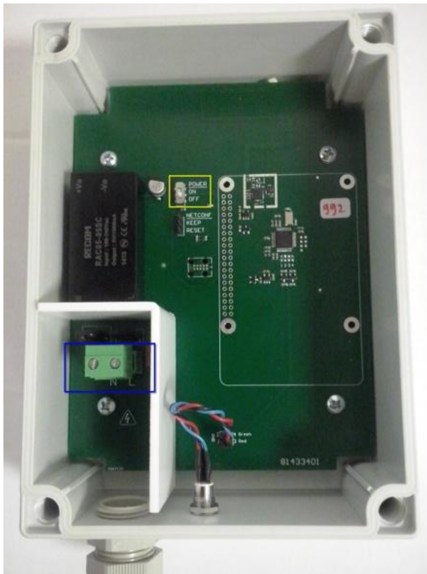
PCB front side