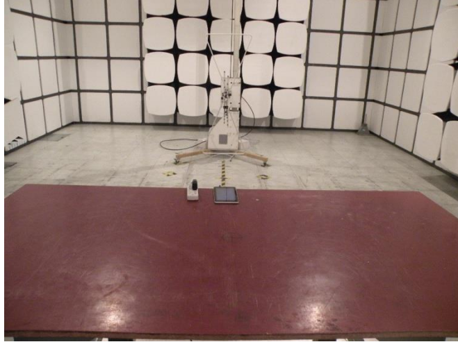
Photos of Radiated emission