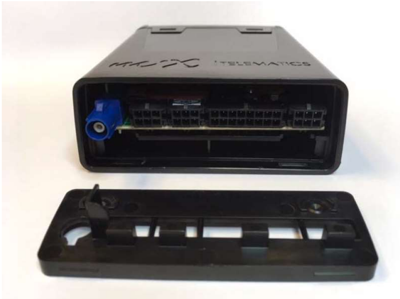
Figure 1: View of MiX 46MC-4G/MiX 46MC-4G-B with Front Panel Removed