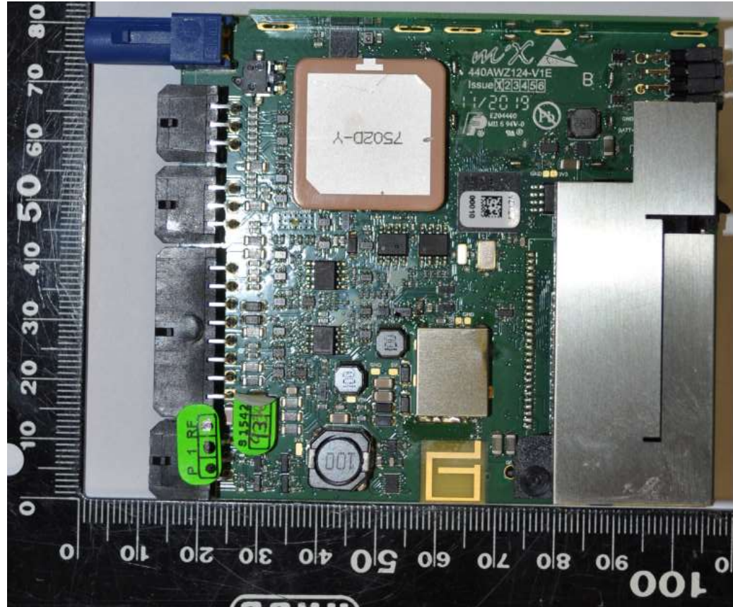
Figure 4: View of PCB (top view)