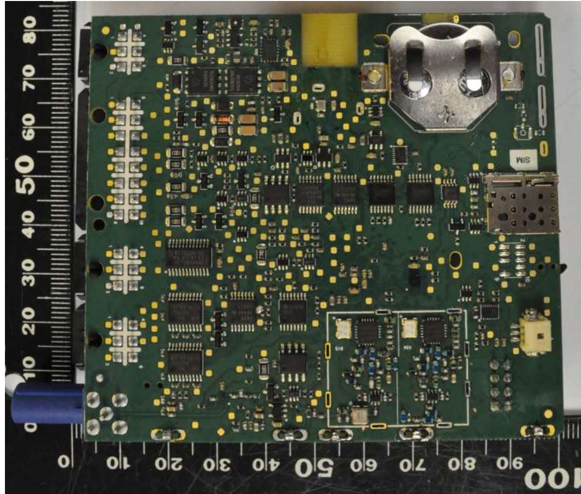
Figure 9: Bottom Side of PCB (without shield)