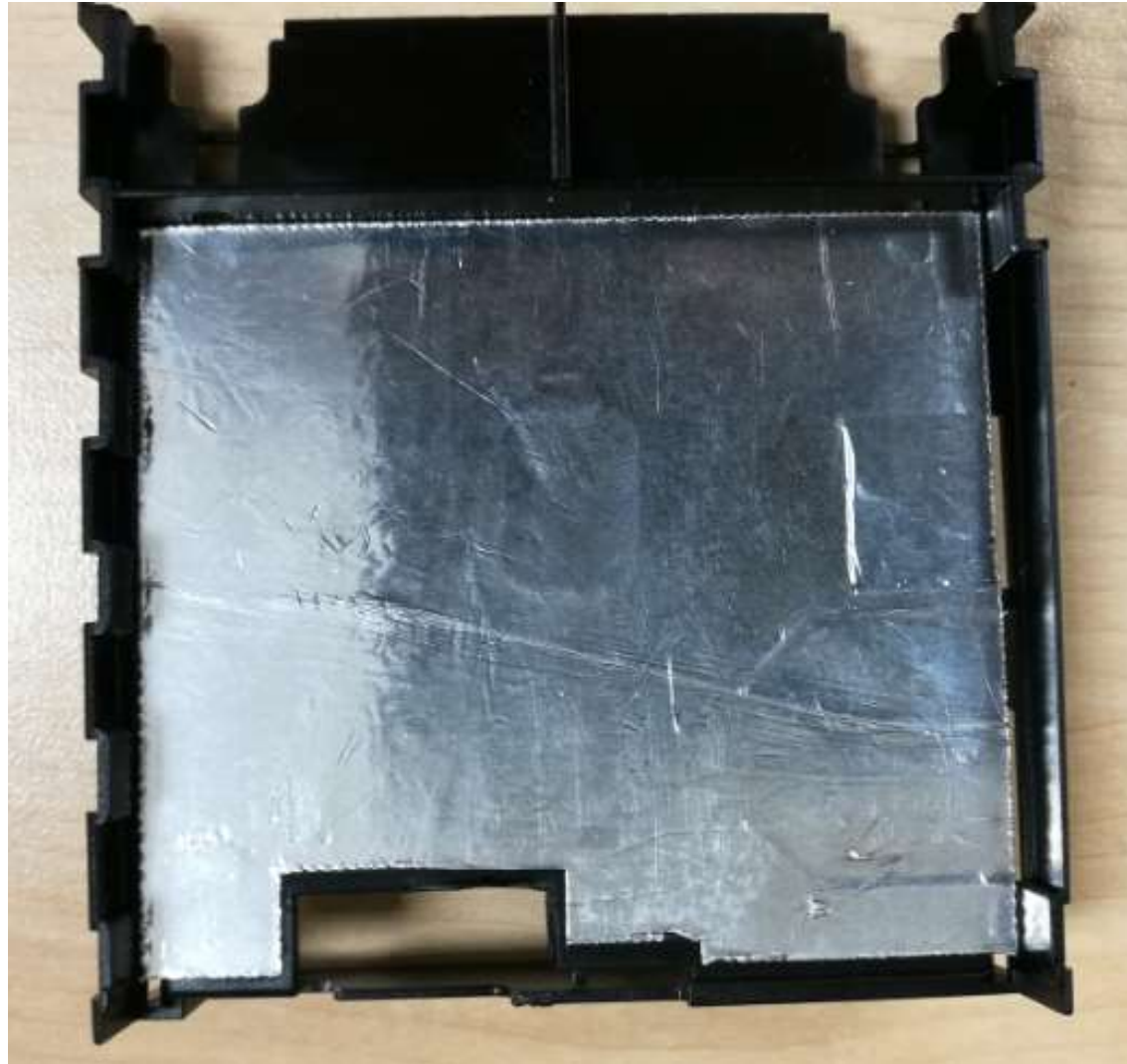
Figure 7: PCB Carrier