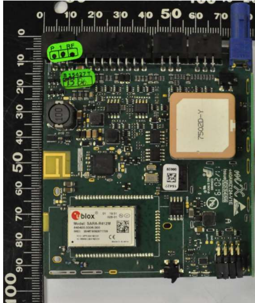
Figure 5: View of Main PCB – Modem and Bluetooth without shields