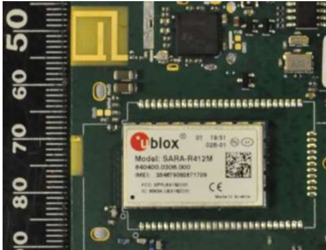
Figure 6: Close up view of modem and Bluetooth