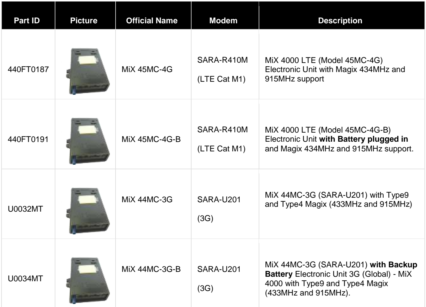
Table 1 Variants in the MiX 4000 Series of Products

We remain at your disposal for any clarifications that may become necessary.