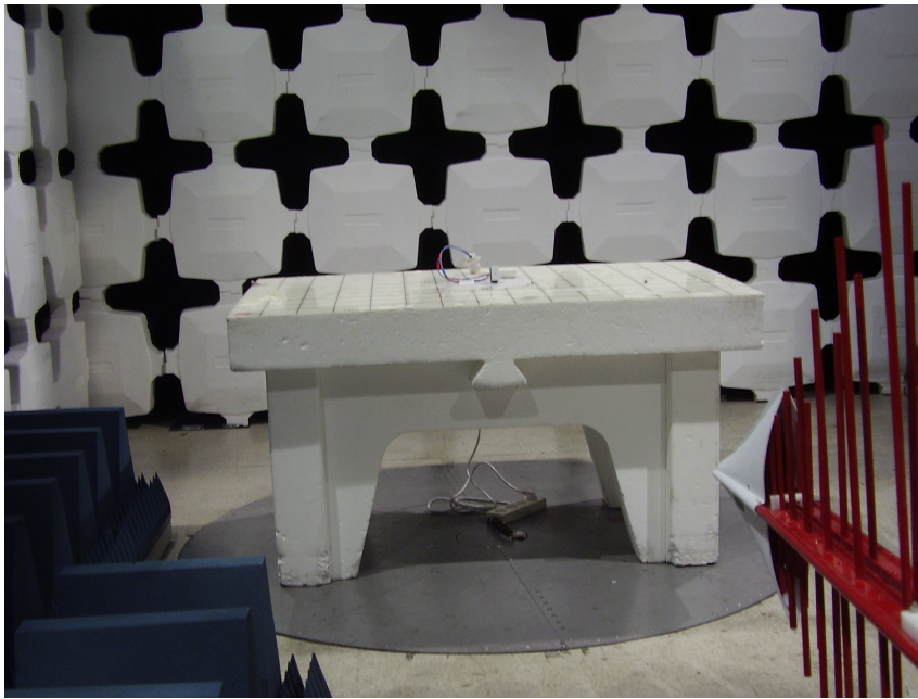
Photo 1. RE test setup