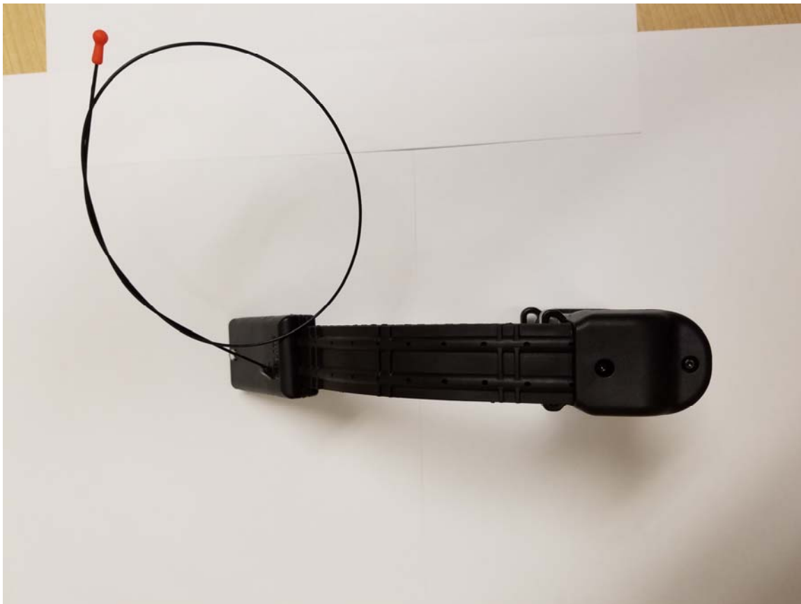
Figure 5 - Specifi-Kali Dog Tracking System – View 5