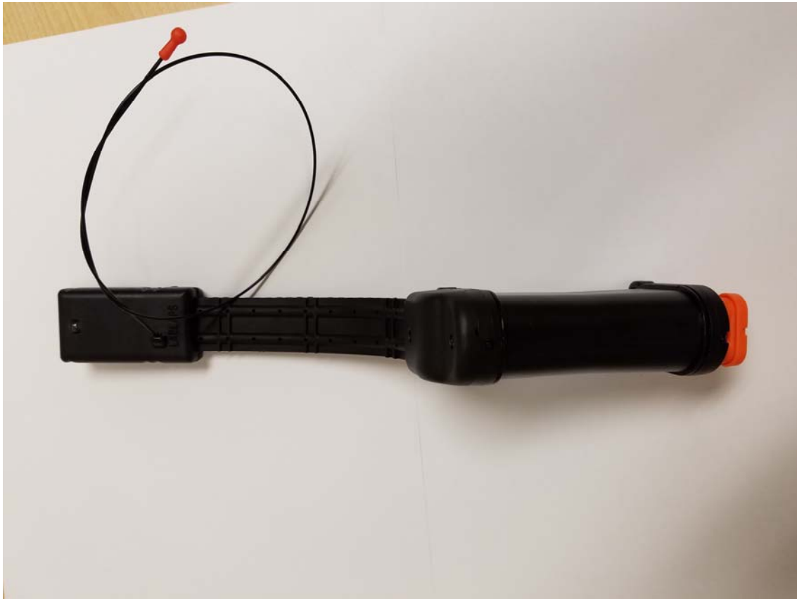
Figure 4 - Specifi-Kali Dog Tracking System – View 4