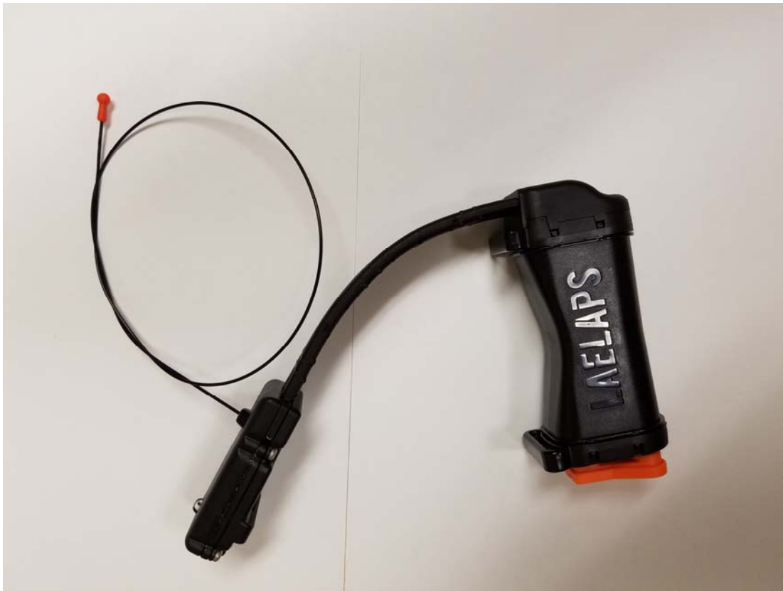
Figure 2 - Specifi-Kali Dog Tracking System – View 2