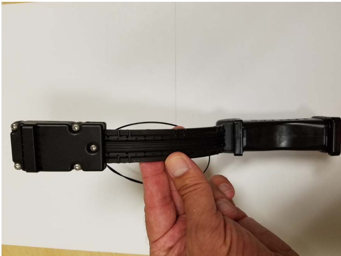
Figure 3 - Specifi-Kali Dog Tracking System – View 3