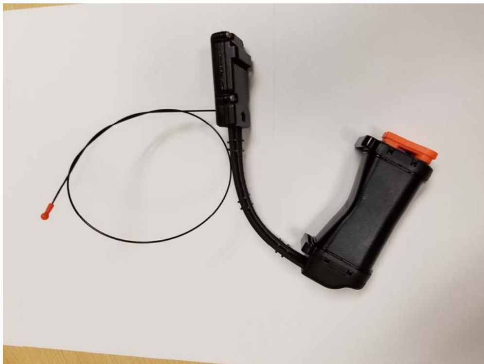
Figure 1 - Specifi-Kali Dog Tracking System – View 1