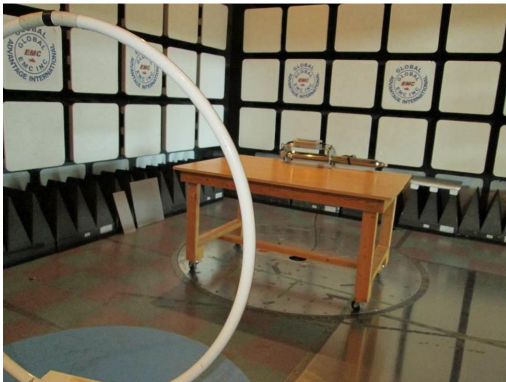
Radiated emissions, 9 kHz – 30 MHz