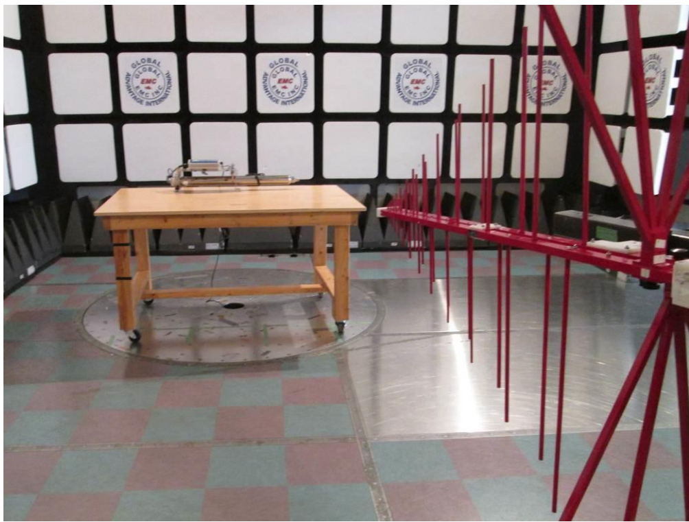
Radiated emissions, 30 MHz – 1 GHz