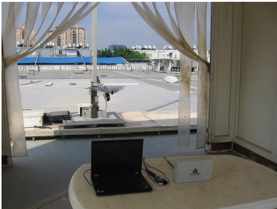
Radiated Emission Test, 200-1000MHz band