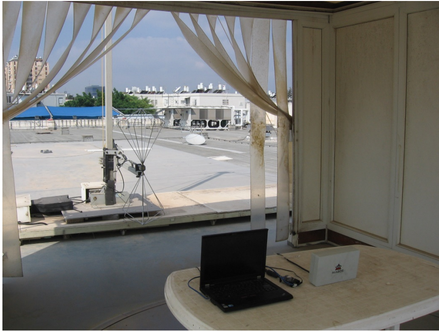
Radiated Emission Test, 30-200MHz band