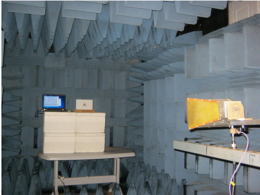
Radiated Emission Test, 1000-18,000MHz band