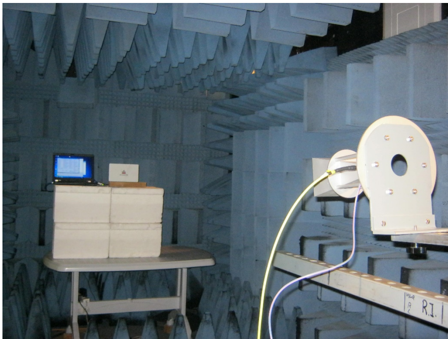
Radiated Emission Test, 18,000-26,500MHz band