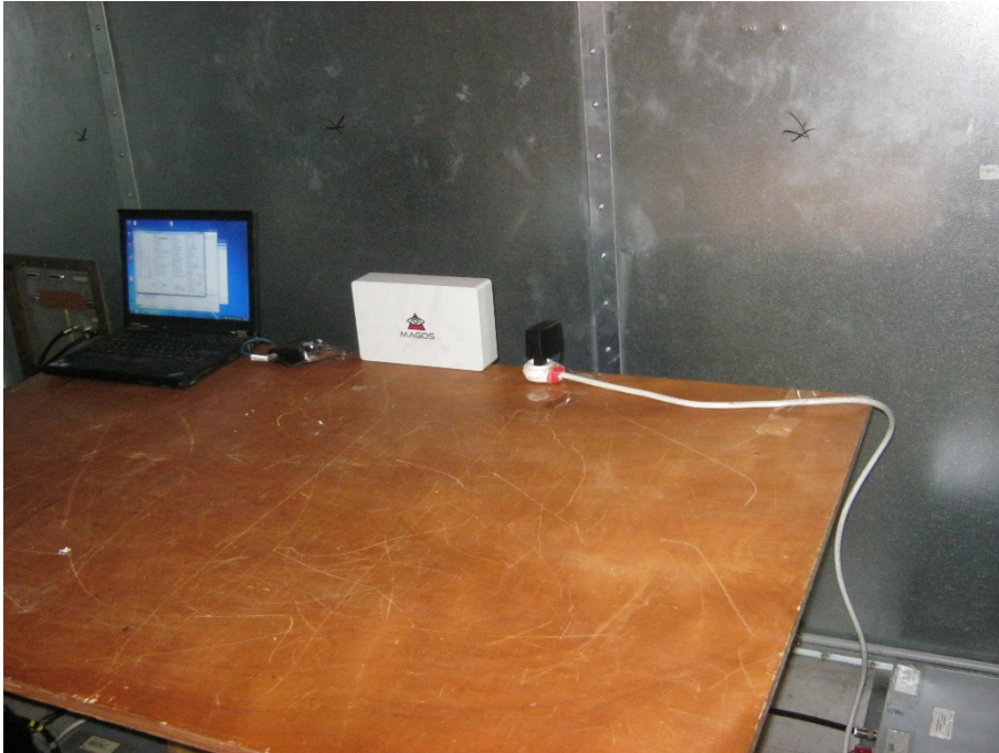
Conducted Emission From AC Mains