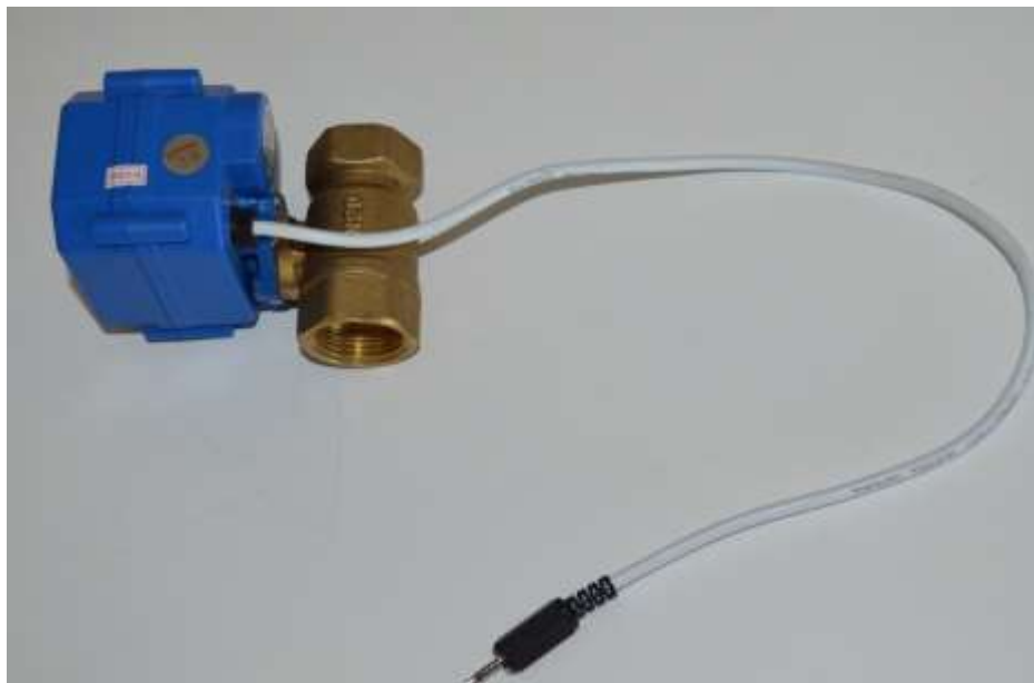
Figure 2- Electrical ball valve- prior to installation