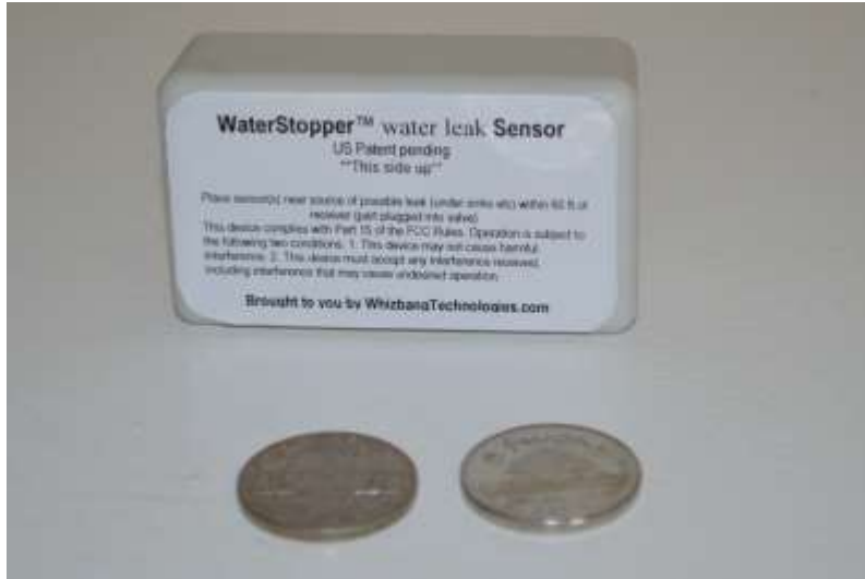
Figure 1- Sensor Top side- coins for size comparison