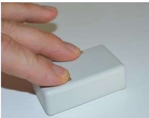
Figure 4- Sensor metal pins up for testing (must be placed with pins down to operate)

5) Place a sensor (figure 4) -metal contact sides up- on a firm level surface. Wet two fingers of the other hand and touch (hold) both metal contacts for 20 seconds- the valve should actuate 6) Within 30 seconds of wet finger touch, you should receive a text telling you the valve has closed in response to a leak