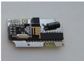
Figure 1 Repeater Inside Top