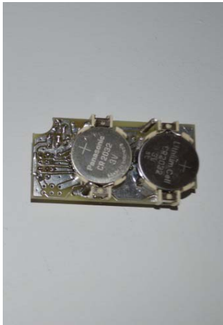
Figure 2 Sensor Inside Bottom