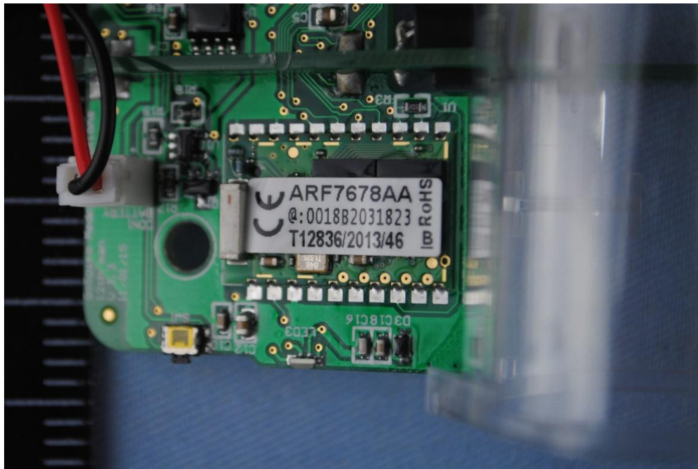
Main board solder side