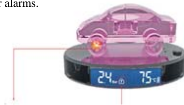
High temperature alarm

The Buzzer sound prompts 10 times when the temperature is higher than high temperature value. The receiver screen displays the corresponding emitter data and the corresponding car tire LED light turns red. Alarm information displays by turns if there are multiple transmitter alarms.