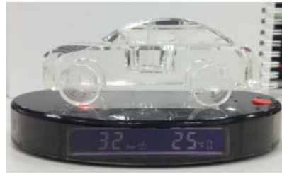
High pressure alarm

high pressure value. The receiver screen displays the corresponding emitter data and the corresponding car tire LED light turns red. Alarm information displays by turns if there are multiple transmitter alarms.