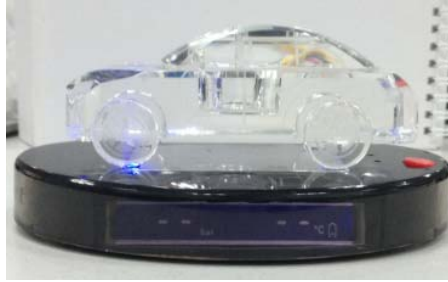
No signal alarm

The product alarms when there is no signal transmitter, and the screen shows '— —, — —'. Alarm information displays by turns. If there are multiple transmitter alarms.