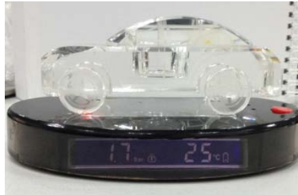
Low pressure alarm

The Buzzer sound prompts 10 times when the pressure is lower than low pressure value. The receiver screen displays the corresponding emitter data and the corresponding car tire LED light turns red. Alarm information displays by turns if there are multiple transmitter alarms.