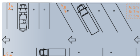
Figure 2: Truck parking

Here are HIKOB recommendations to draw your installation map: