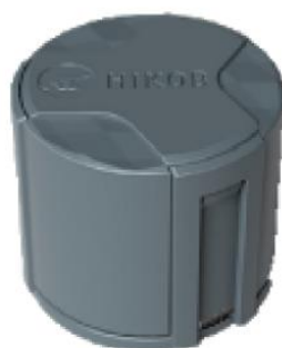
Figure 1: External view of HIKOB WISE COW

The HIKOB WISE COW Parking detects parked vehicles, and the HIKOB WISE COW Traffic detects passing vehicles. Both detections are based on the earth's magnetic field variations measurements. Measures are broadcasted through the HIKOB radio network, possibly using routers, and are treated by the HIKOB GATEWAY, platform supplying and managing data, allowing monitoring.