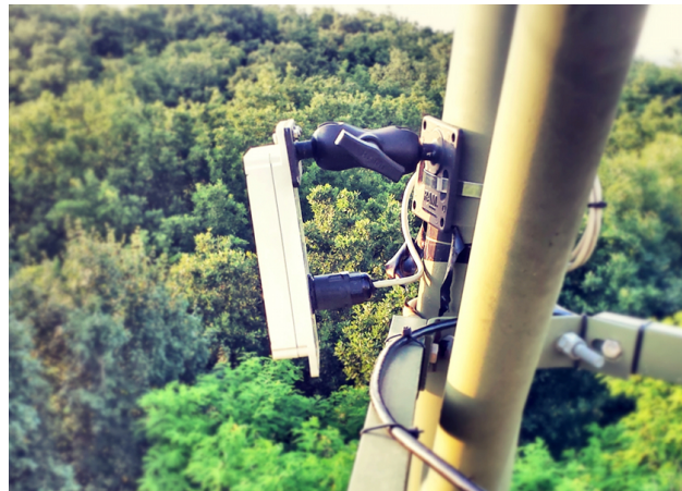
Figure 4: View of the HIKOB GATEWAY attached on a pole with RAM mount joints