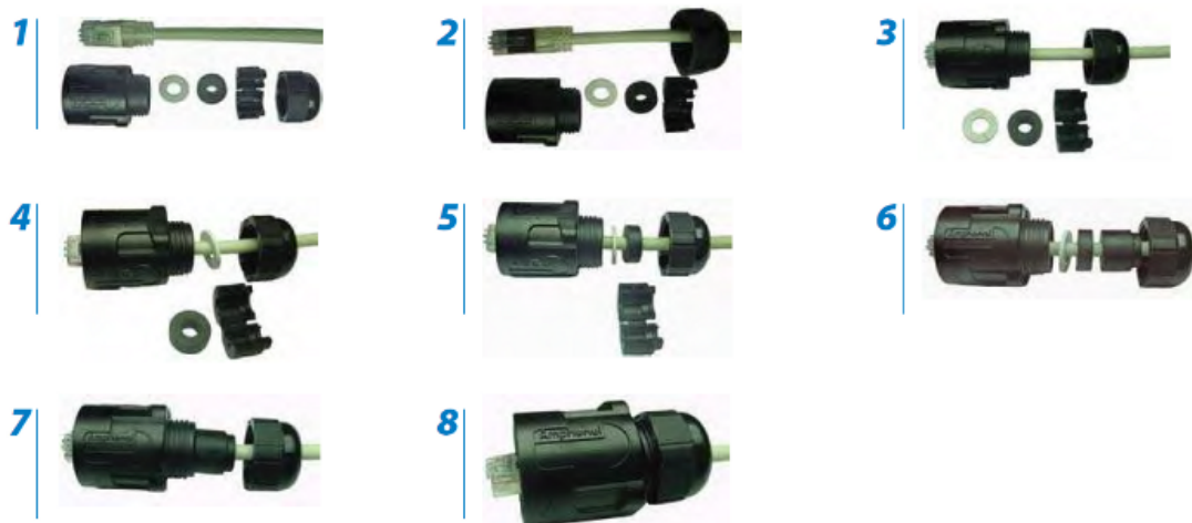
Figure 3: Steps to dress the Ethernet cable with the Amphenol connector housing.

HIKOB provides an industrial connector housing (Amphenol Socapex RJF RB 6, which is IP67), to be mounted on the ethernet cable before connecting it to the HIKOB GATEWAY. This is a protective sealed and hardened envelope which can be added around any standard RJ45 connector. Choose an Ethernet cable suitable for outdoor use. You don't need tools to equipy your ethernet cable, just follow these step by step graphical instructions: