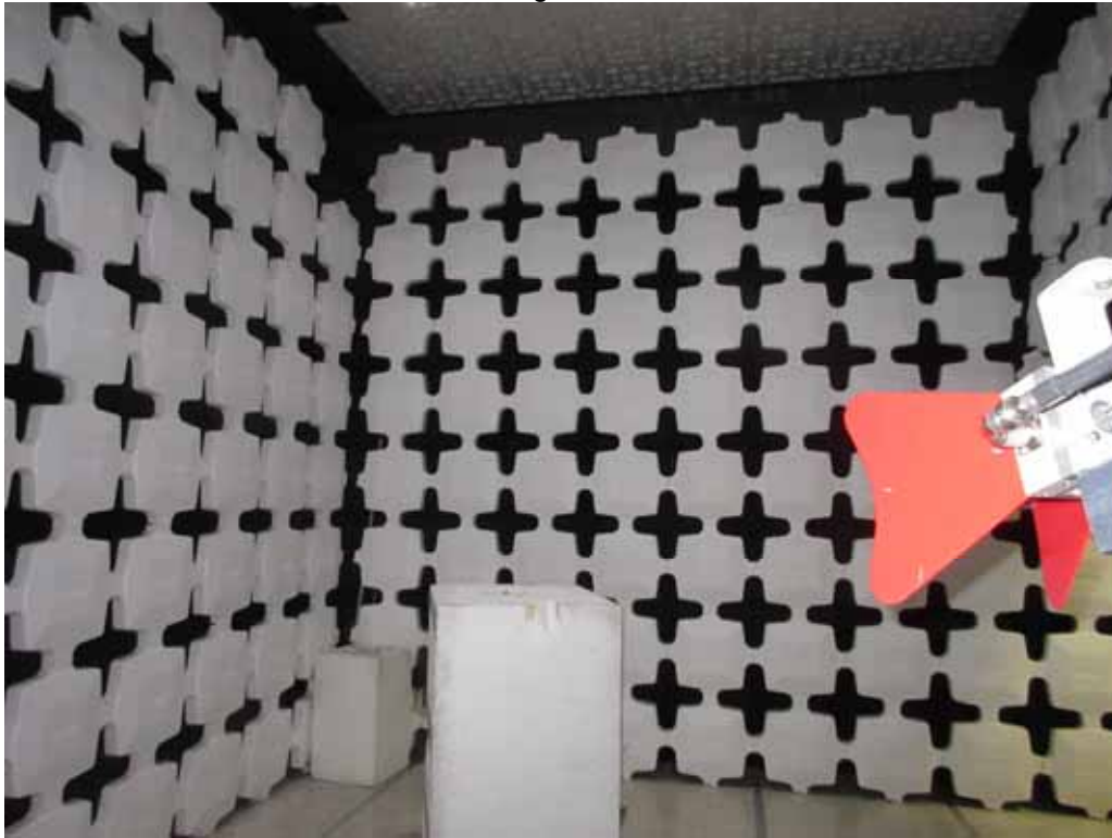
Test Setup for Radiated Emissions, 1GHz to 10GHz – Horizontal Polarization