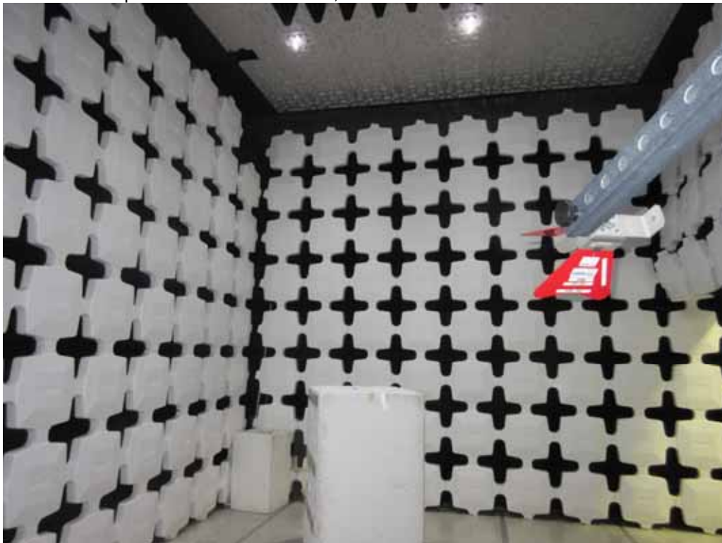
Test Setup for Radiated Emissions, 1GHz to 10GHz – Vertical Polarization