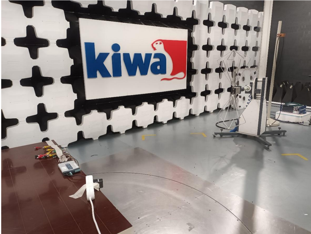
Photo 1 Photograph test setup radiated emissions 30-250 MHz, report section 3.1