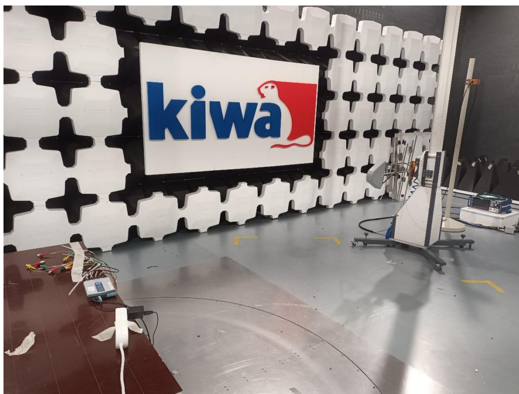
Photo 2 Photograph test setup radiated emissions 250-1000 MHz, report section 3.1