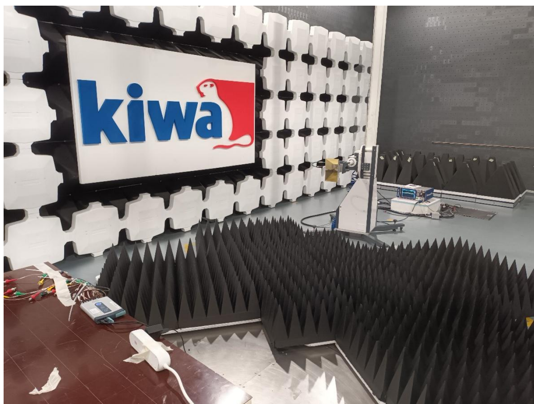
Photo 3 Photograph test setup radiated emissions 1-18 GHz, report section 3.1