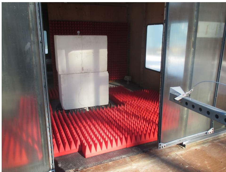
Vertical Polarization, 18 to 25 GHz