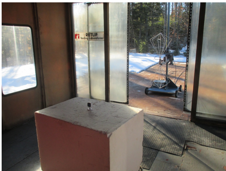
Vertical Polarization, 30 to 200 MHz