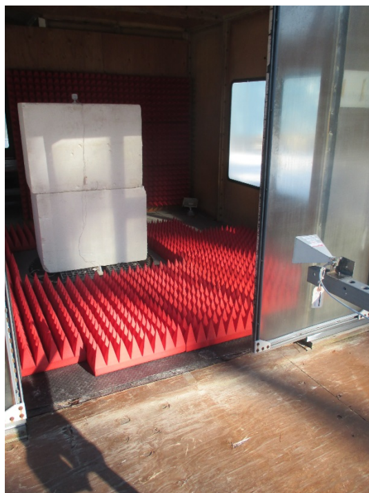
Horizontal Polarization, 18 to 25 GHz