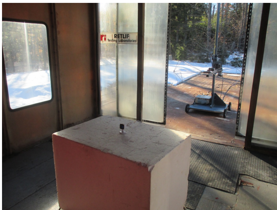
Horizontal Polarization, 30 to 200 MHz