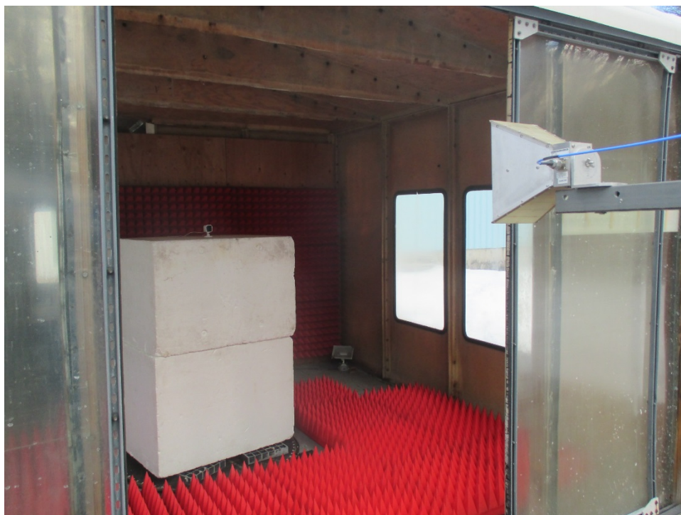
Horizontal Polarization, 1 to 18 GHz