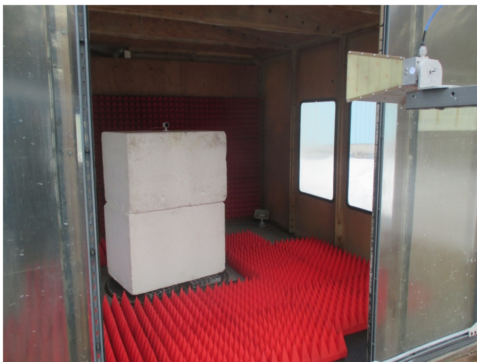
Vertical Polarization, 1 to 18 GHz