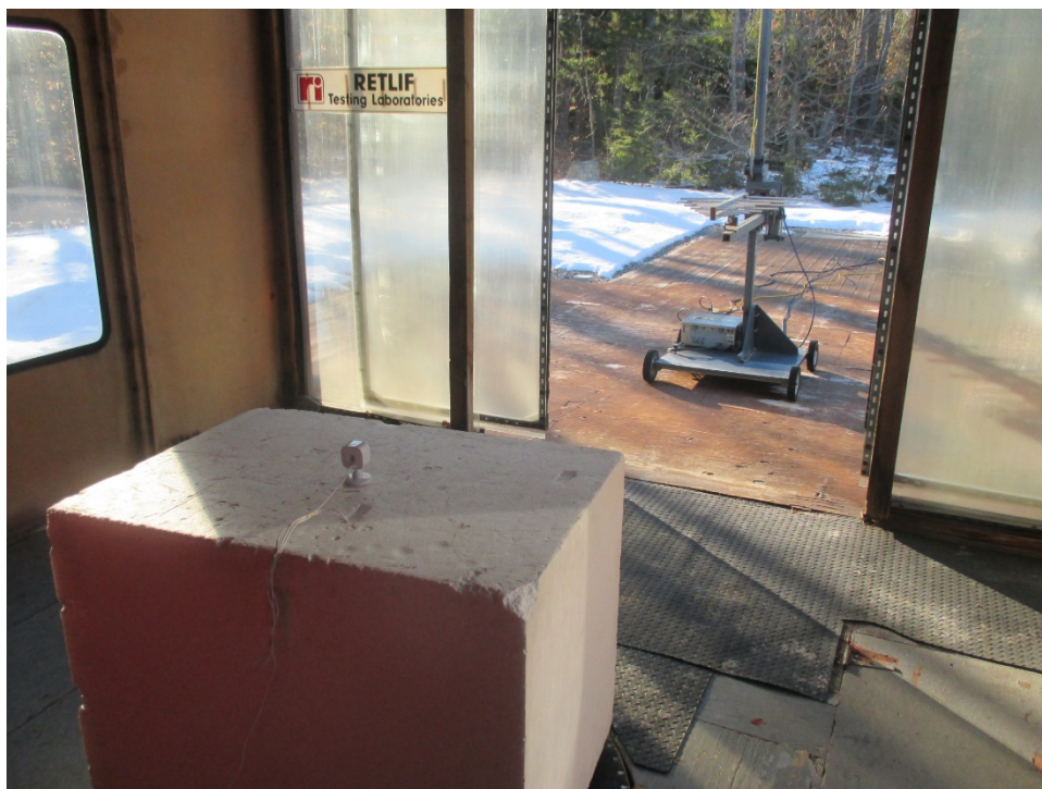
Horizontal Polarization, 200 MHz to 1 GHz