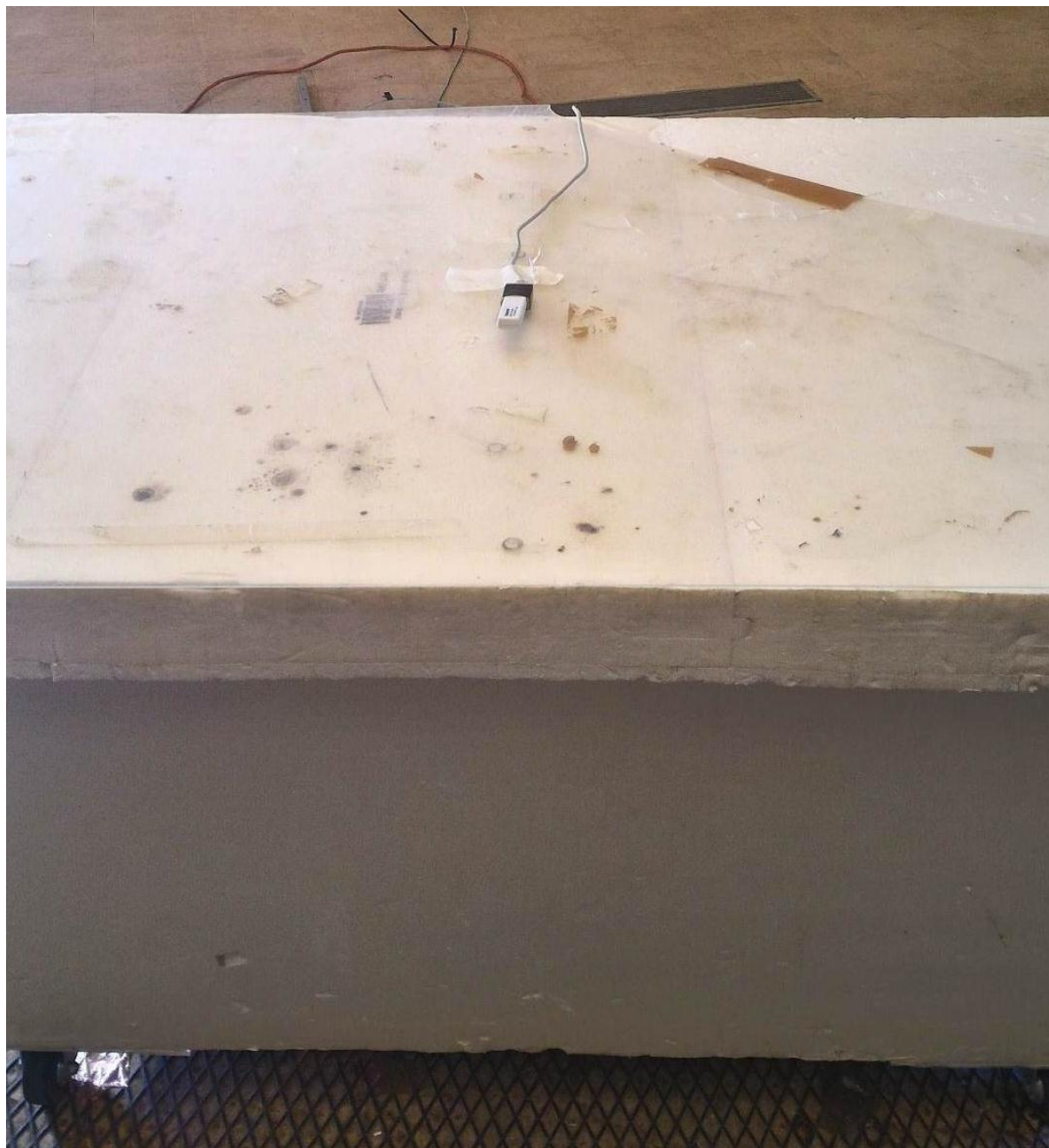
Radiated emissions measurements (Below and above 1GHz same setup for measurements)