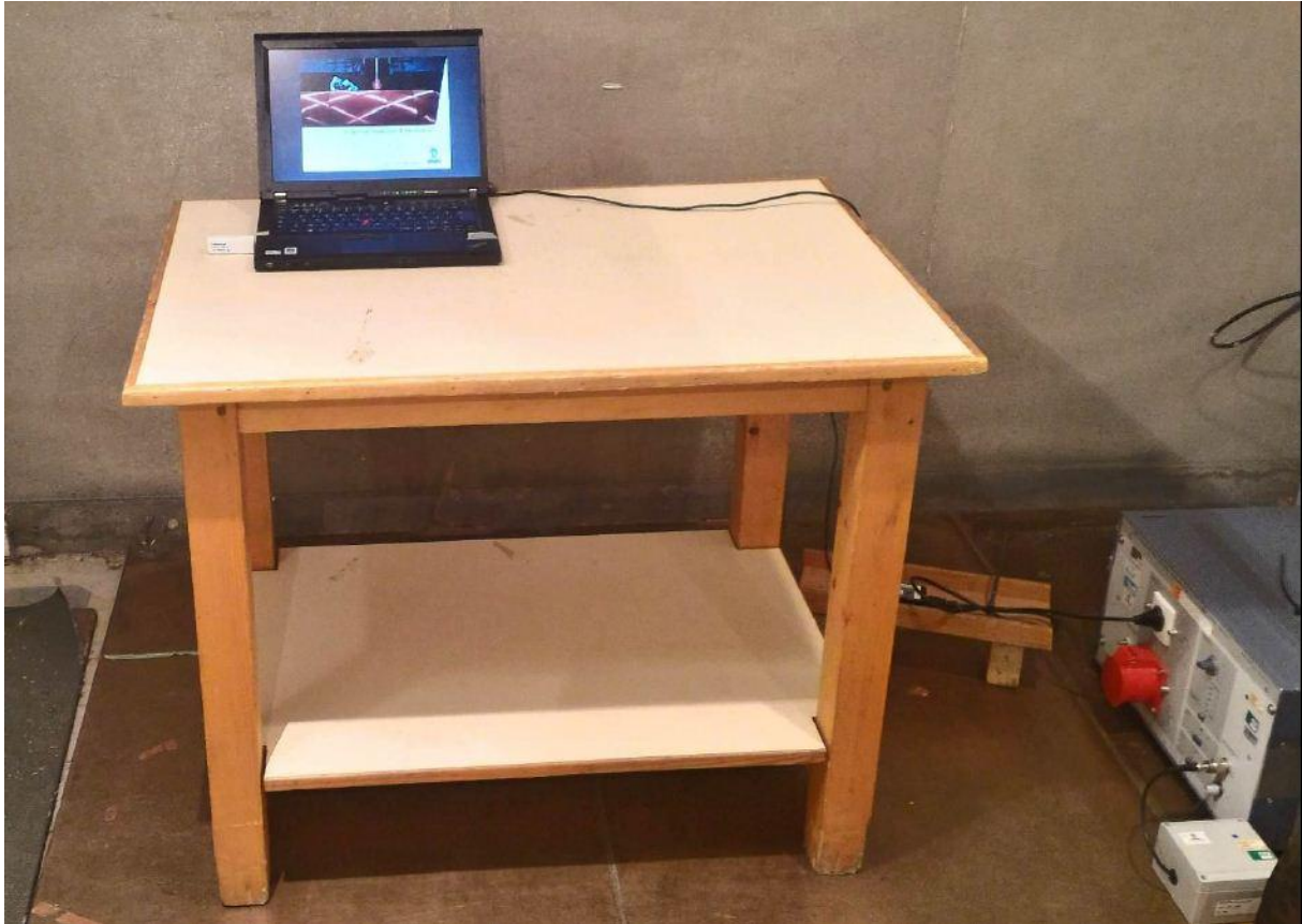
Conducted emission measurements (front view)