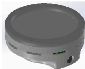
Wireless power transmitter