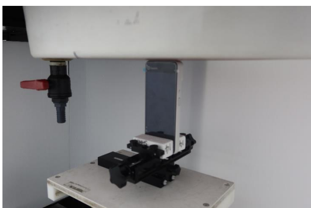
Top Side at 0 mm