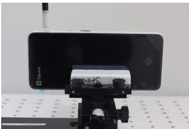
Right Side at 2 mm