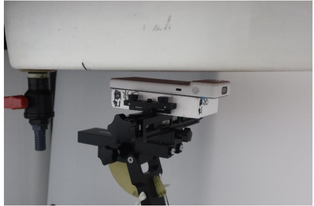
Back at 10 mm