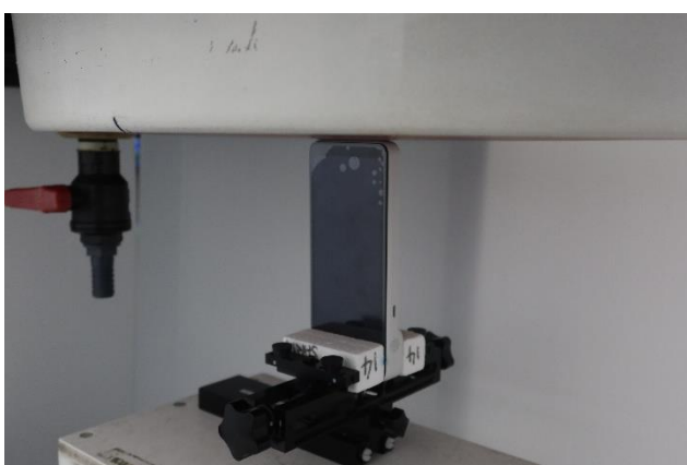
Bottom Side at 0 mm