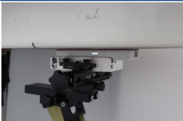
Front at 0 mm