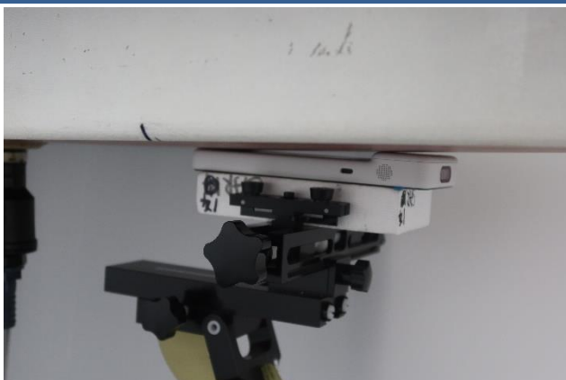
Back at 0 mm