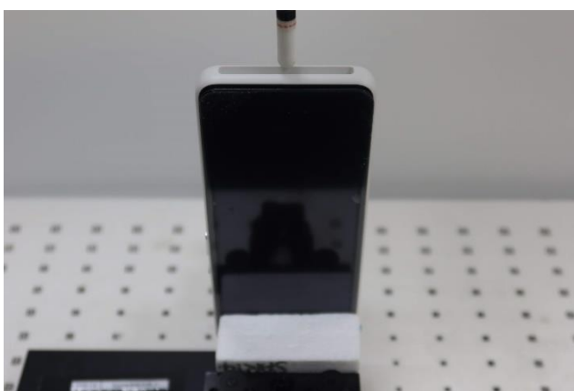
Bottom Side at 2 mm