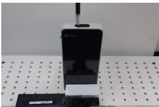
Top Side at 2 mm