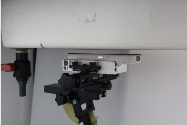
Front at 10 mm