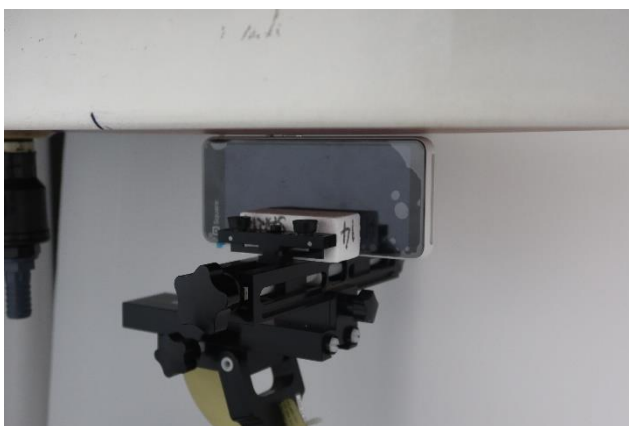
Right Side at 0 mm