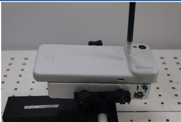
Back at 2 mm