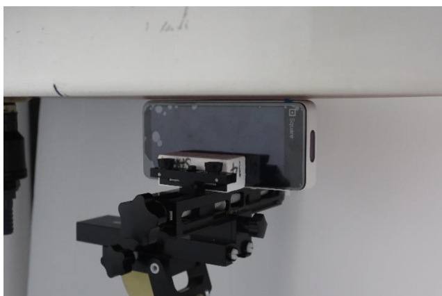
Left Side at 0 mm