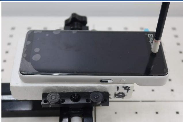
Front at 2 mm