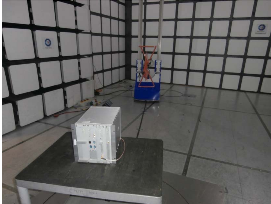
Radiated Emissions 30 MHz to 1 GHz