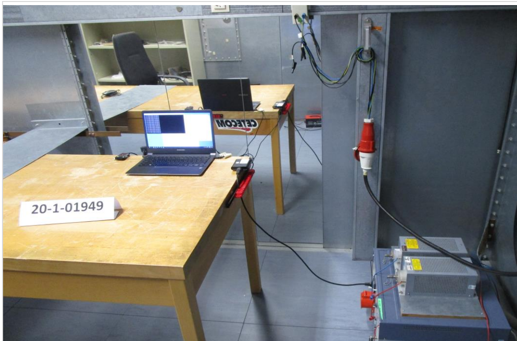
Photograph 1: EUT test setup in the AC-Power lines conducted Emission room