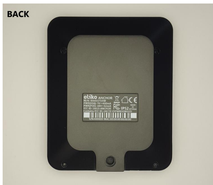
Figure 2 Label location on product