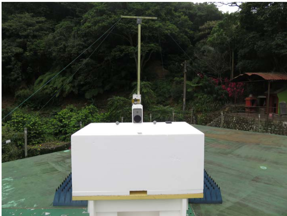
Above 1 GHz