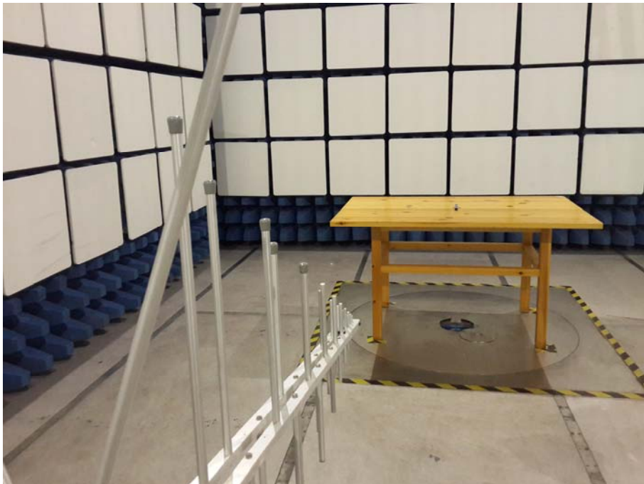
30 MHz-1 GHz