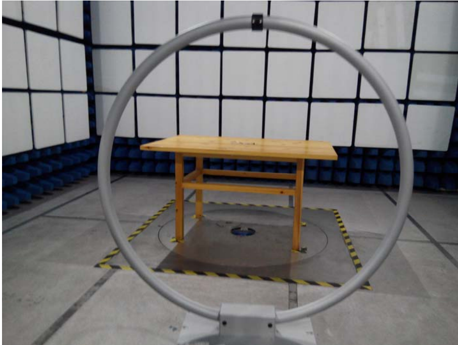
Below 30 MHz