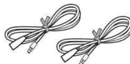
(2) 12' HEADSET/HELMET CABLES