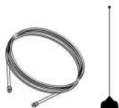
COAX CABLE & ANTENNA