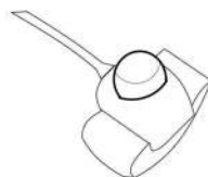
VELCRO PUSH TO TRANSMIT BUTTON